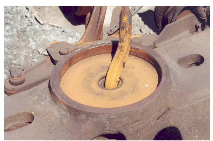
Figure 4. Centre plate and pin of truck D

The body (male) centre plate and the truck (female) centre plate of truck D on the platform in question showed signs of abrasion and wear. The centre pin was bent but had remained in place (see Figure 4).