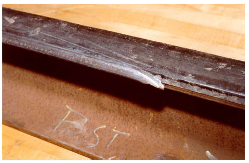
Figure 2. Witness marks and sheared flow lip on the gauge side of the north railhead

The TSB Engineering Laboratory examination (Report No. LP 71/01) showed that there was a flow lip up to 12 mm thick on the gauge side of the railhead. There was no flow lip on the field side of the rail.