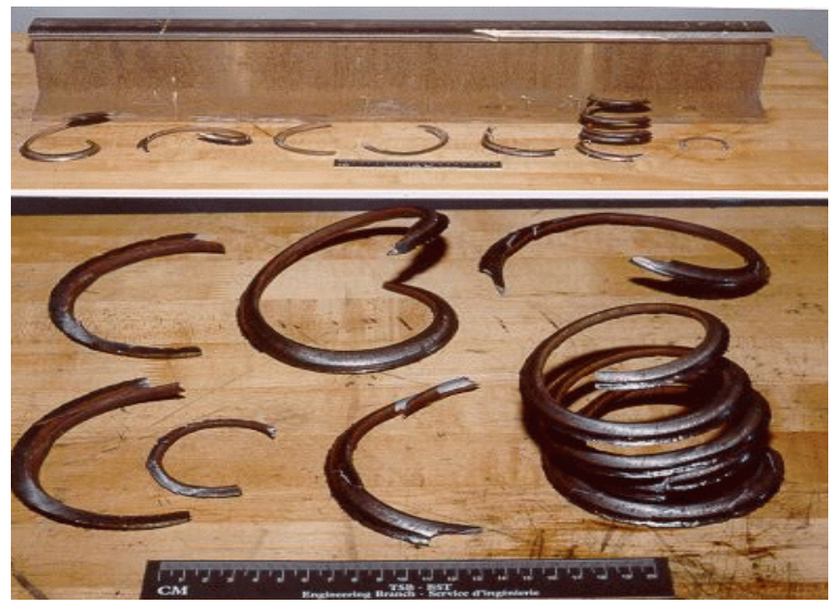
Figure 1. Curled strips of flow lip sheared from the rail

The TSB Engineering Laboratory examination (Report No. LP 71/01) showed that there was a flow lip up to 12 mm thick on the gauge side of the railhead. There was no flow lip on the field side of the rail.