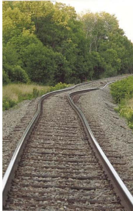
Photo 1. Post-derailment view of track buckle, looking westward, at Mile 38.85

The train was 7540 feet long, weighed approximately 6230 tons, and was powered by two locomotives. The train consist comprised 33 loaded container cars, each of which consisted of one, three, four or five platforms, amounting to 112 platforms in total. A train safety inspection and No. 1 air brake test were performed before departure from Halifax and no exceptions were noted.