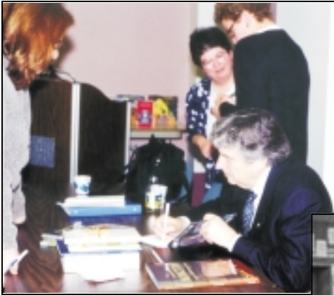
Roch Carrier signing copies of his works from the Moncton Public Library Collection.