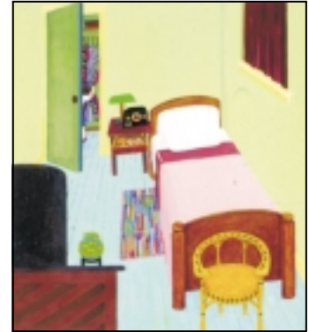
Taken from Tales of a Gambling Grandma (Montreal: Tundra Books, 1986).

met the friends who would have a pivotal influence on her. Soon after meeting them, she entered an ashram where the development of her spiritual life, discipline and the family life she missed so much following the loss of her