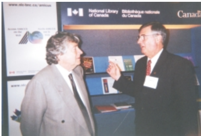
National Librarian Roch Carrier with Parliamentary Librarian Richard Paré.