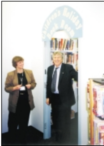
Nose Hill Public Library, Calgary.