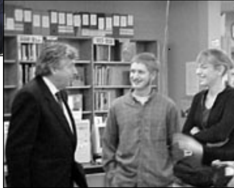
Roch Carrier with students at Sir John A. MacDonald High School, Nova Scotia.

I wish to express my appreciation to everyone who made us welcome at their institutions and to the following colleagues for organizing these visits: