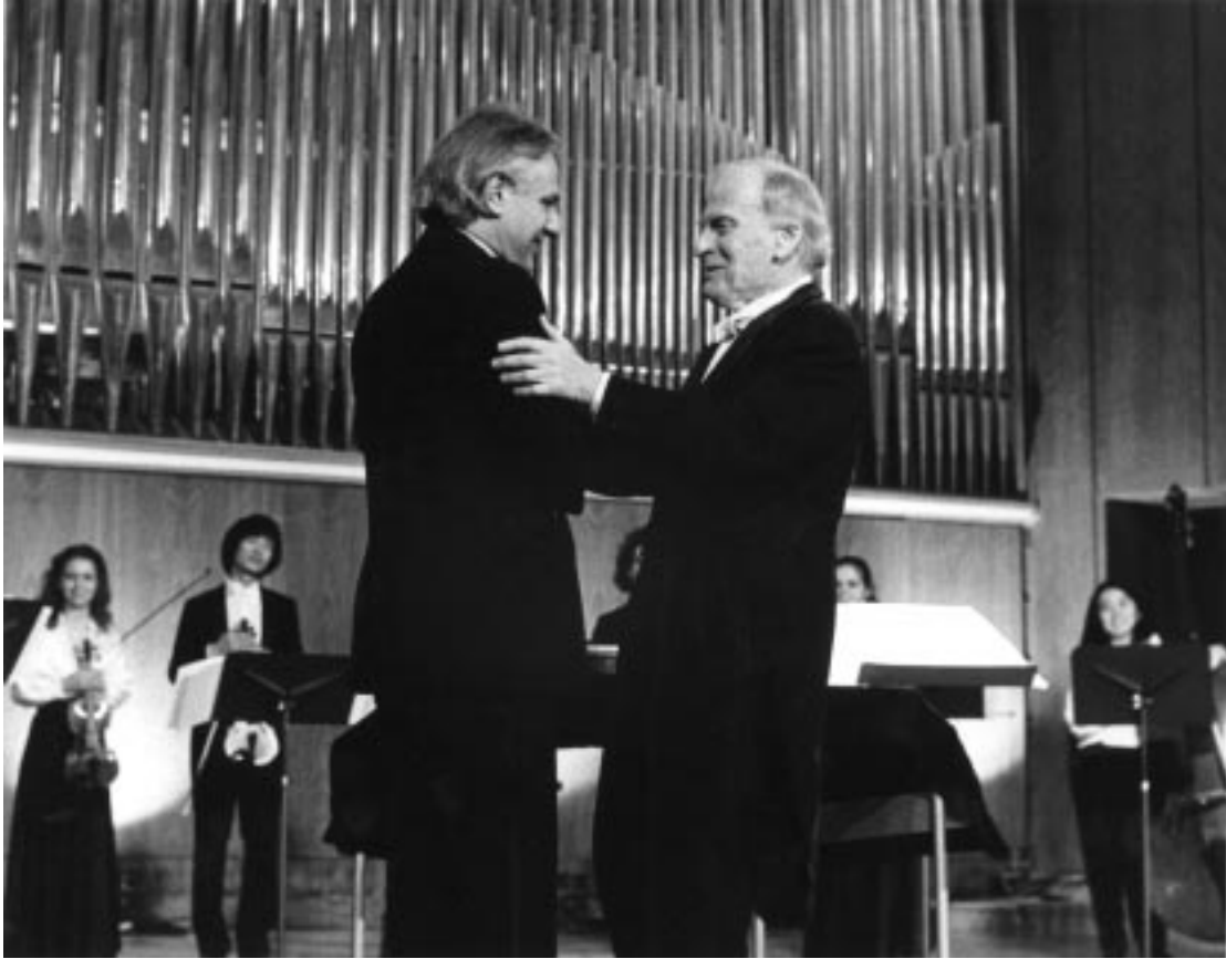
André Prévost and Sir Yehudi Menuhin during the premiere of the Cantate pour cordes, 1987.