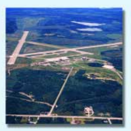
Sydney airport is the most sophisticated regional airport in Canada.