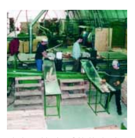
Atlantic Canada's only pre-finished hardwood flooring manufacturer, Forest Insight, targets export markets.

The University College of Cape Breton (UCCB) offers an innovative blend of degree, diploma and certificate programs, combining liberal arts and sciences with engineering, technology and traditional trades. Located near Sydney, UCCB serves approximately 3,250 full- and part-time students. It is a