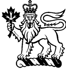
The Governor General's Standard is a symbol of the Crown's sovereignty in Canada

The Governor General is the Queen's representative in Canada. The Queen appoints the Governor General on the advice of the Prime Minister. The Governor General usually serves for five years. One of the most important roles of the Governor General is to ensure that Canada always has a Prime Minister. For example, if no party had a clear majority after an election, or if the Prime Minister were to die in office, the Governor General would have to choose a successor.