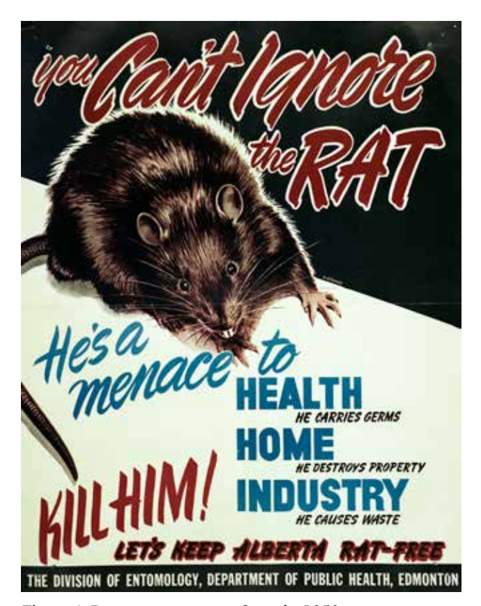
Figure 4: Rat awareness poster from the 1950s.

Public education and information continued. Posters and brochures on rat control were widely distributed; displays were presented at local fairs, picnics and rodeos; and talks were presented to schools, 4-H clubs, agricultural societies, Chambers of Commerce and to just about anyone who would listen. "Call of the Land," an Alberta Agriculture agricultural news program began broadcasting in 1953 and was used to disseminate information on rat control.