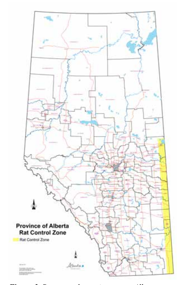
Figure 3. Rat control zone in eastern Alberta.

Rat bait was supplied free of charge to all municipalities that had appointed a pest control inspector. Warfarin, the first anticoagulant rodent poison, was available in 1953.