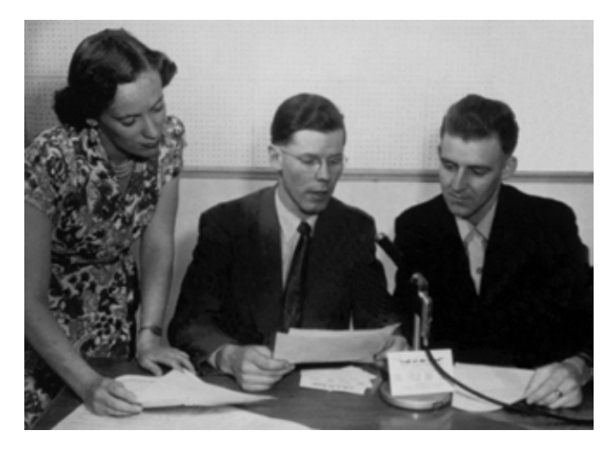
Figure 5: Radio broadcasts were made on the program "Call of the Land"

At a series of meetings with members of Indigenous communities, an Alberta Agriculture staff member ate warfarin-treated rolled oats while discussing rat