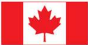
National Flag of Canada