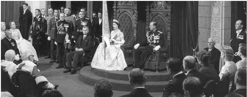
Queen Elizabeth reads the Speech from the Throne in the Senate Chamber in 1957.

Her Majesty's relationship to Canada began with her first Royal Tour of the country in 1951 as Princess Elizabeth. On that tour, as well as the 22 that have followed, the Queen has established ever-deeper ties with the Canadian people. She has visited every province and territory and has often been heard to refer to Canada as "home."