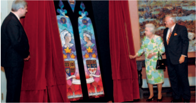
The Queen unveils the model for the Diamond Jubilee Window at Rideau Hall, the Governor General's residence, on June 30, 2010.