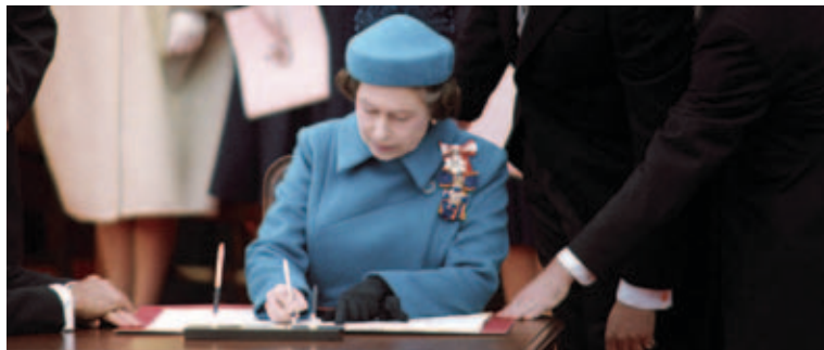
Queen Elizabeth II signs the Proclamation of the Constitution Act , 1982, patriating Canada's Constitution.

The members of the Royal Family also play an active role in the life of Canadians as representatives of the Crown. They periodically tour Canada, connecting with Canadians and their current affairs. Many members of the Queen's family serve as Colonels-in-Chief of regiments of the Canadian Forces. They are also very much involved in promoting the values of duty and service that are an intrinsic part of the Canadian identity. The Queen, for example, is the Sovereign of the Order of Canada, part of her awards system that recognizes the good achieved by Canadians. Members of the Royal Family serve as patrons of other awards, such as the Duke of Edinburgh's Award Program for young people, and of charity work, such as that carried out by The Prince's Charities, a network of charities of which the Prince of Wales is patron or president. In these ways, the Crown and its representatives are truly woven into the fabric of Canadian society.