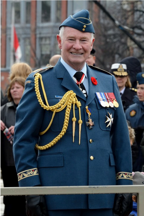
His Excellency at a Remembrance Day ceremony.

What is the official title of His Excellency the Right Honourable David Johnston?