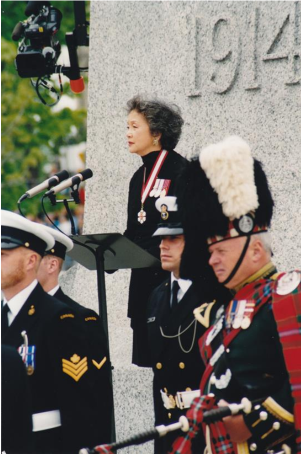
Governor General Adrienne Clarkson delivering this speech.

Governor General Adrienne Clarkson delivered one of her most memorable and moving speeches in 2000, at the National War Memorial. What was the occasion?