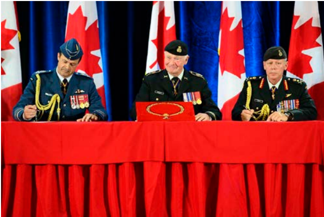
Governor General David Johnston at the ceremony marking the Canadian Armed Forces' Change of Command from General Tom Lawson (left) to General Jonathan Vance (right).