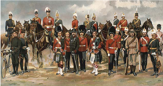
The Canadian Militia, 1898.