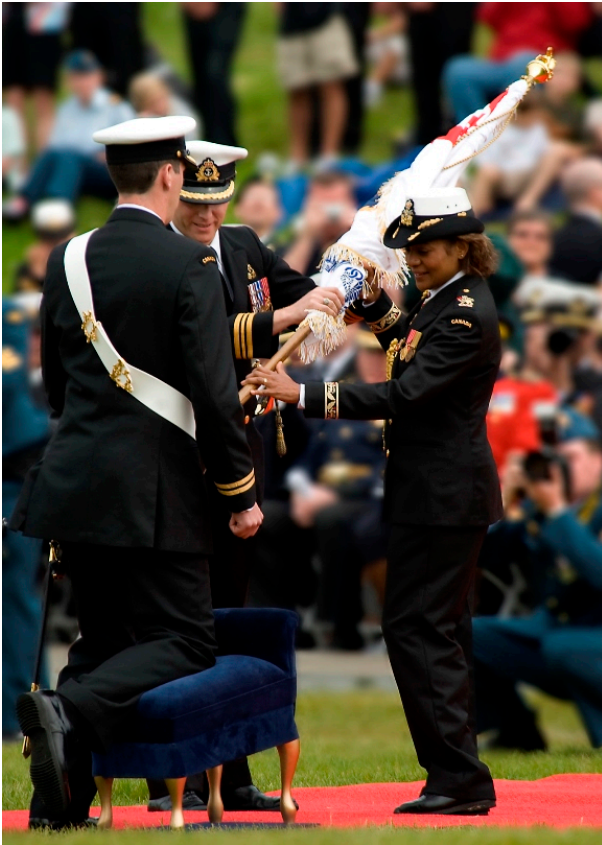
Governor General Michaëlle Jean presents the newly consecrated Queen's Colour to Maritime Command in Halifax in 2009.