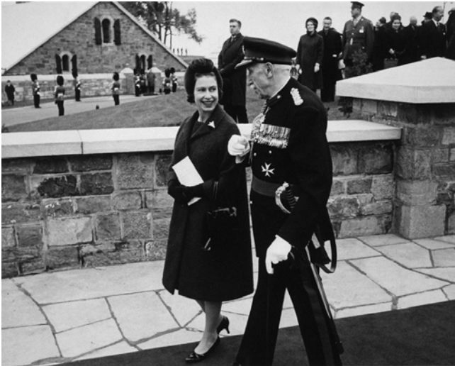
I visited the Citadelle of Québec with Her Majesty The Queen in 1964.