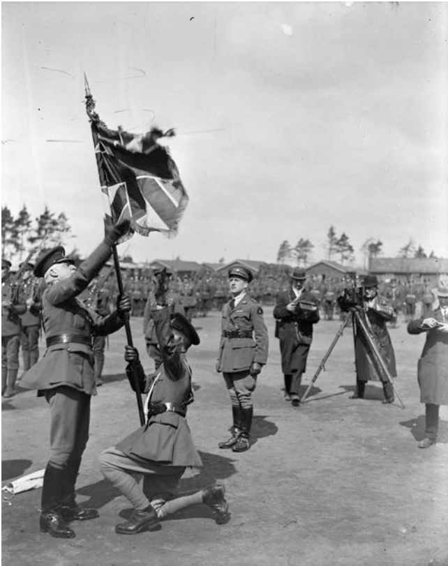
The Duke of Connaught presents regimental colours, circa 1915.

Photo credit: Department of National Defence, Library and Archives Canada, PA-006159.