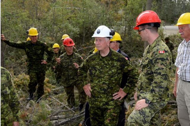
Governor General David Johnston visits the Canadian Armed Forces' Immediate Reaction Unit, in Whitehorse, Yukon.