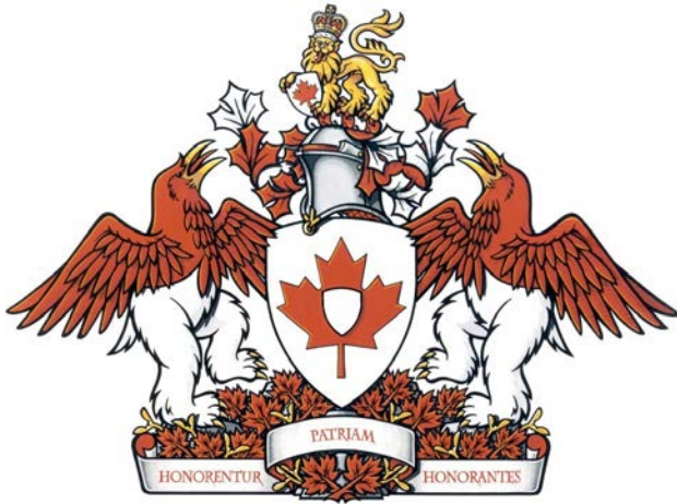
Arms of the Canadian Heraldic Authority.