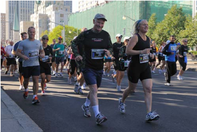
Governor General David Johnston at the Canada Army Run in Ottawa.