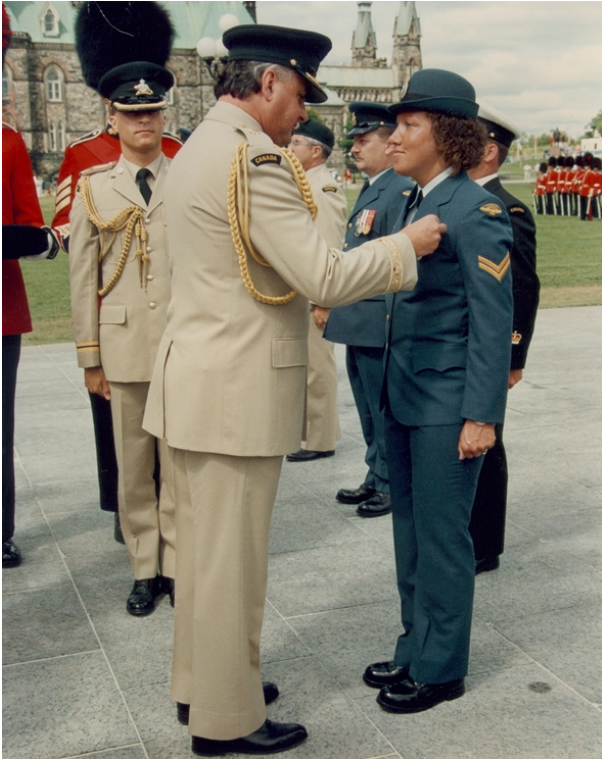
Governor General Ramon John Hnatyshyn awards the Gulf and Kuwait Medal in 1991.