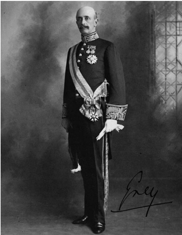
Earl Grey, the ninth governor general of Canada.