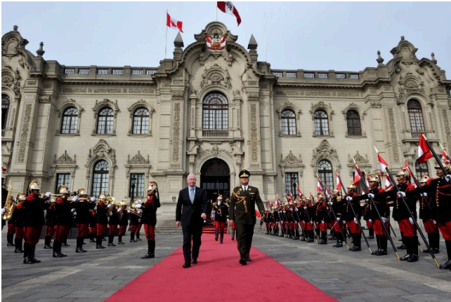
Governor General David Johnston arrives in Lima, Peru.