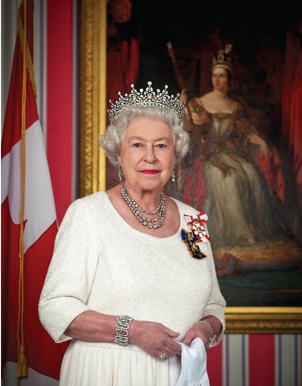
Her Majesty Queen Elizabeth II, Queen of Canada.