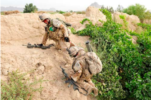
Canadian soldiers in Afghanistan in 2010.

Photo credit: Sgt Daren Kraus, Department of National Defence, AR2010-0223-21.