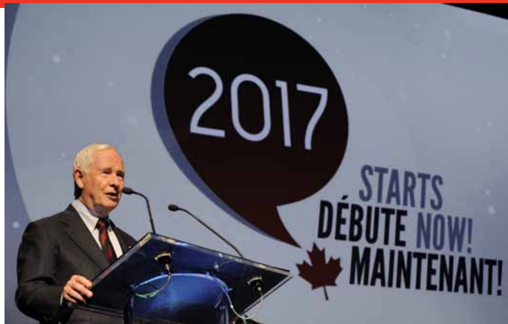
His Excellency delivered the opening address at the Canada 150/2017 Starts Now Conference held on June 27, 2013, in Ottawa.

Please submit your suggestions and innovative ideas online in the Member's corner section of our website ( www.gg.ca/Canada2017Consultations ) no later than October 18, 2013. Ideas will be reviewed by the Advisory Council at its November meeting.