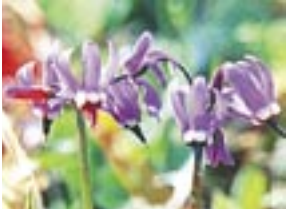
Arctic Shooting Star

The mining roads around Keno City provide easy access up into the mountains, so visitors have an excellent opportunity to view alpine wildlife that is