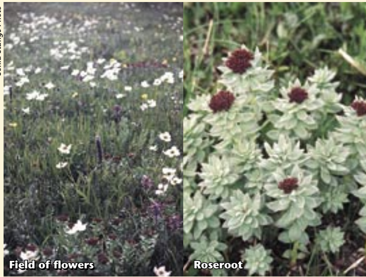
Field of flowers

While you're enjoying the flowers, please avoid trampling the fragile vegetation, especially in the wetter areas. The butterflies depend on these plants for food.