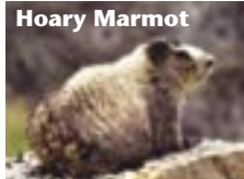
Hoary Marmot Welcome to Keno City! We hope you enjoy our

hospitality, our beautiful natural surroundings, and our rich mining history. Keno City, population 20, is nestled in the mountains at about 3,100 feet and retains the feel of a 1920s boomtown.