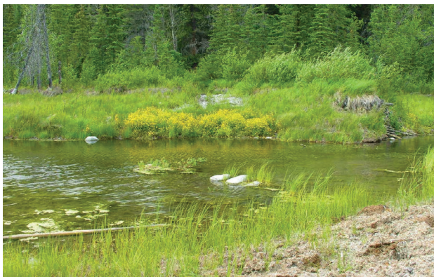
Lake in the Liard Basin where Western Toads have been found.