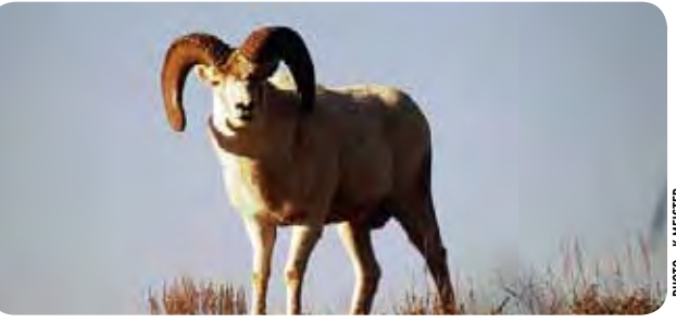
6. [] Legal [] Not legal [] Need a better view