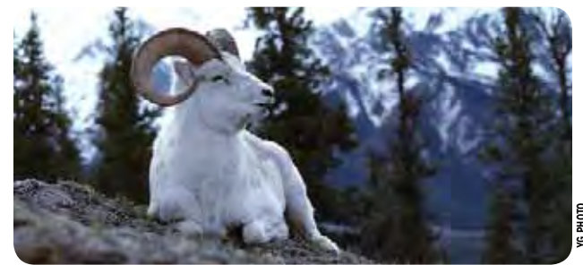
4. [] Legal [] Not legal [] Need a better view