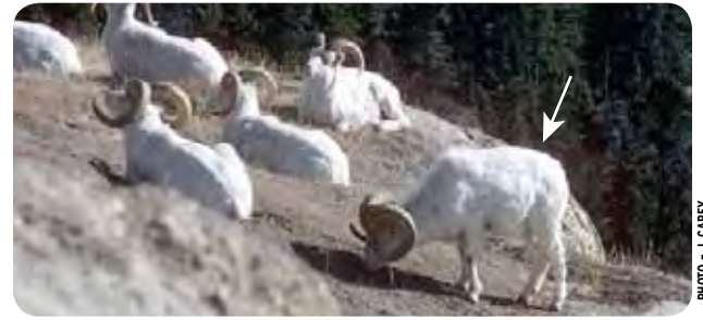
3. [] Legal [] Not legal [] Need a better view