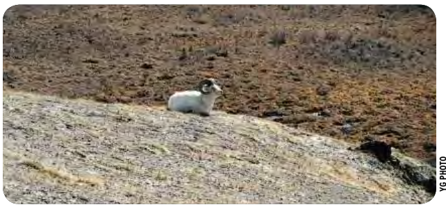
8. [] Legal [] Not legal [] Need a better view

7. [] Legal [] Not legal [] Need a better view