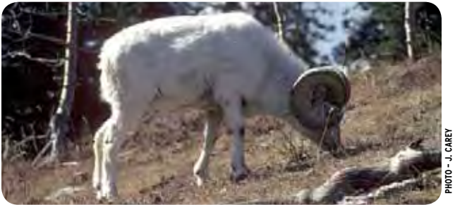
5. [] Legal [] Not legal [] Need a better view