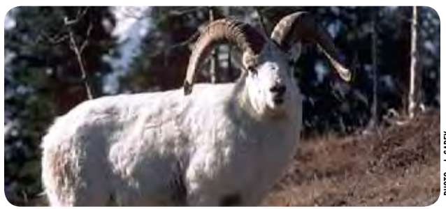
1. [] Legal [] Not legal [] Need a better view

Study each photo and check your response: Is the sheep legal to harvest, not legal, or do you need a better view? See Answers.