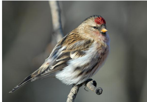
Common Redpoll – a familiar year-round bird in the Dawson area.

Yukon River Campground: This forested Yukon Parks campground is just a short ride on the George Black Ferry across the Yukon River from downtown Dawson. The forests are home to Swainson’s and Varied thrushes, Hammond’s Flycatchers, White-winged Crossbills, Townsend’s Warblers, and the occasional Tennessee Warbler. The viewing platform is a good place to watch for Peregrine Falcons which nest on the bluffs along the river; listen for the raucous calls of the begging young later in summer.