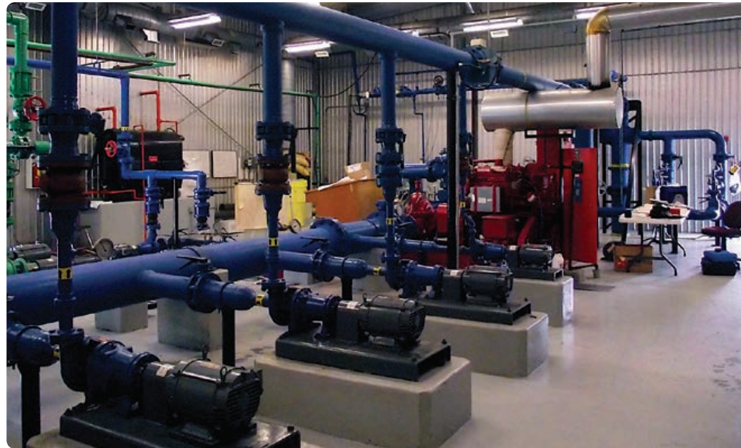
Sampling creek water for dissolved metals (left), and Village of Mayo water treatment plant (above)