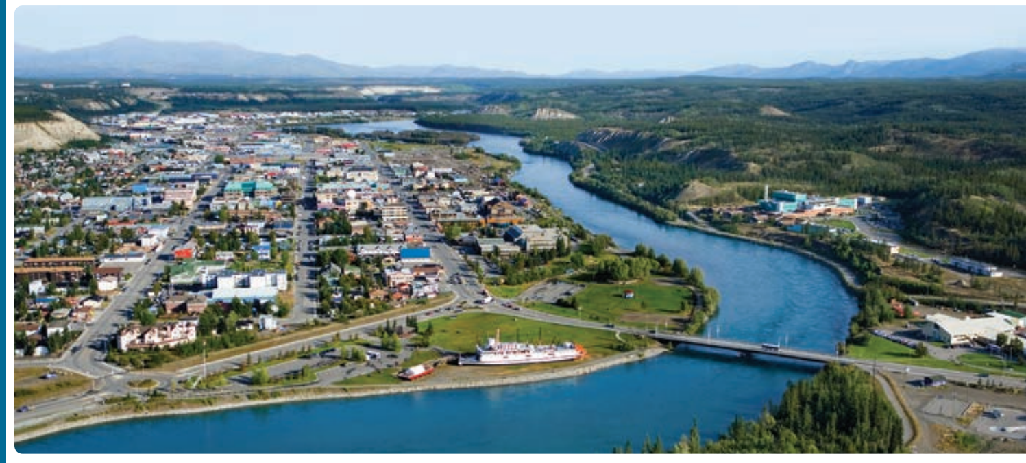
City of Whitehorse, and Yukon River