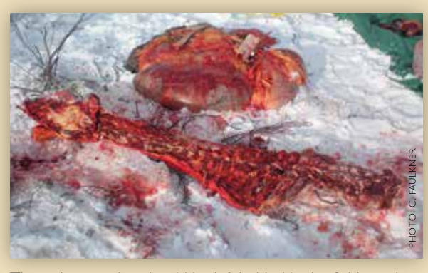
The only parts that should be left behind in the field are the gut pile, the spine and perhaps the head and hide. Other bones can be left only if all the meat has been removed. No meat can be left in the field.