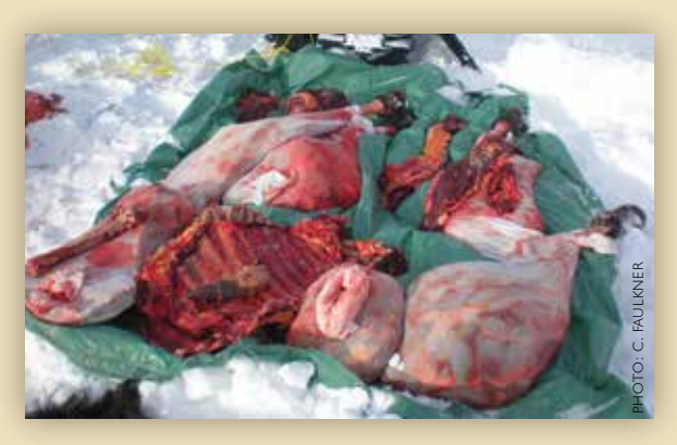
A properly field dressed bison. All of the meat has been removed.