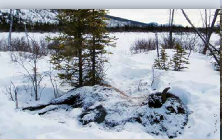
You must make every effort to track down and kill a wounded bison.