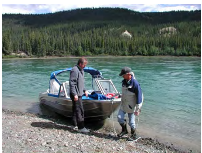
Recreational boating on Thirty Mile, Summer 2002

The Yukon is in a privileged position with regards to the condition of values associated with the Thirty Mile Section of the Yukon River. There have been no significant negative changes to any values for which the river was nominated (refer to summary in Appendix A).