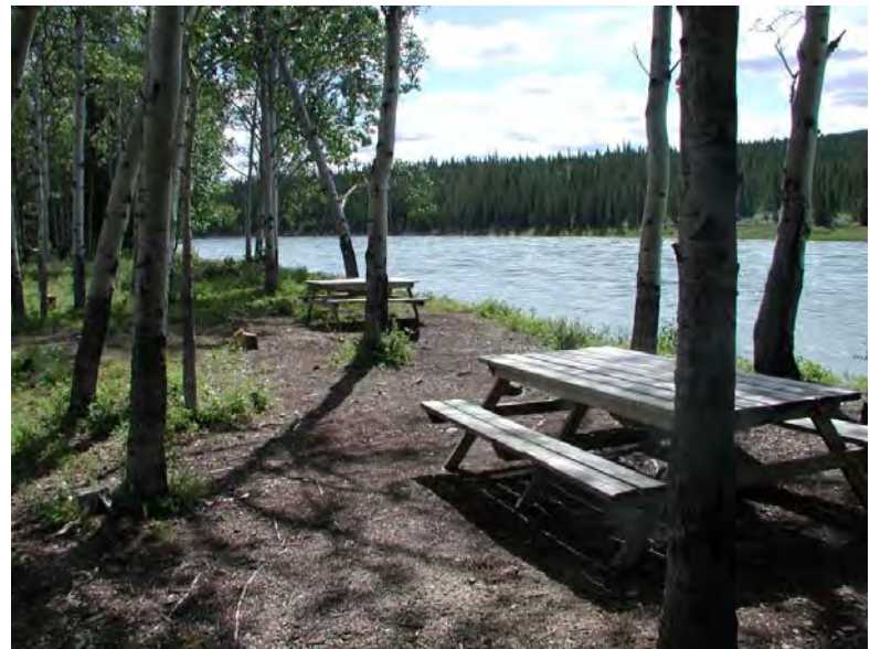
Designated campsite along Thirty Mile, Summer 2002

National Frameworks. National thematic frameworks were adopted by the Board between 1997 and 1998, and revised between 2000 - 2001. These now provide a mechanism for organizing and classifying natural, cultural and recreational values represented by rivers. They can also be used to identify unique or rare values that a river brings to the System. The structure of the frameworks has been used throughout this report and the river's original "nomination values" are redefined according to the theme elements. Values that have been identified over the past 10 years, which did not show up in the original nomination document or management plan have been added. The revised list is contained in Appendix A.