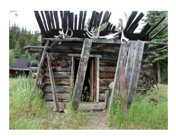
Old cabin at Hootalinqua, Summer 2002

The 1998 Fox Lake Forest Fire did not directly impact management of the river. However, given the extent and location of the fire, it is expected that natural values associated with the biotic environment have been affected.