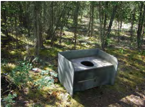
Makeshift latrine at informal campsite on Thirty Mile, 2002 To be replaced with sealed privy.

It is recommended that the 1990 management plan be reviewed with the Ta'an Kwach'an Council and affected departments, prior to any new work taking place based on the Implementation Priorities. In the context of the Ta'an Kwach'an land claim settlement, there may be different priorities and issues that require attention, particularly related to First Nation heritage values along the river. Final Agreement obligations through Chapter 13 (Heritage) may provide direction on implementation priorities over the next 10 years and need to be discussed in the context of heritage river management.