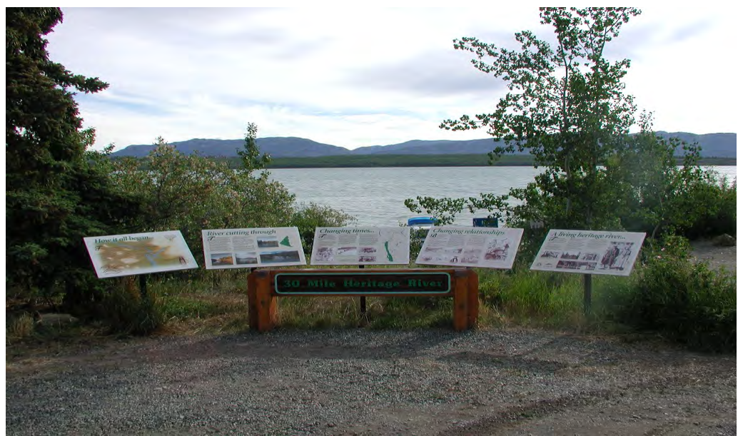
Thirty Mile Interpretive Panels at Lake Laberge Campground, Installed 1993