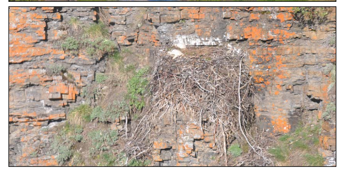
Figure 2. Top: Gyrfalcon nestlings in stick nest made by golden eagles. Middle: River valleys cliffs surveyed for raptor nests. Bottom: golden eagle nestlings.