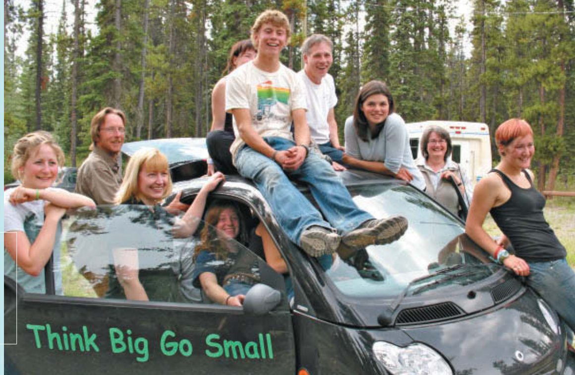
Environment Yukon staff have been using a Smart Car since 2007.