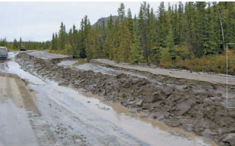
Flooding on the North Klondike Highway in August 2008

This Action Plan is based on a common understanding that climate change is happening, that human behaviour is a contributor, and that a coordinated response is needed.