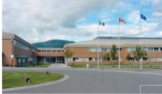
Yukon College, a central hub for northern research.