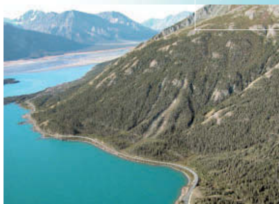
Southern Kluane Lake near the Slims River.