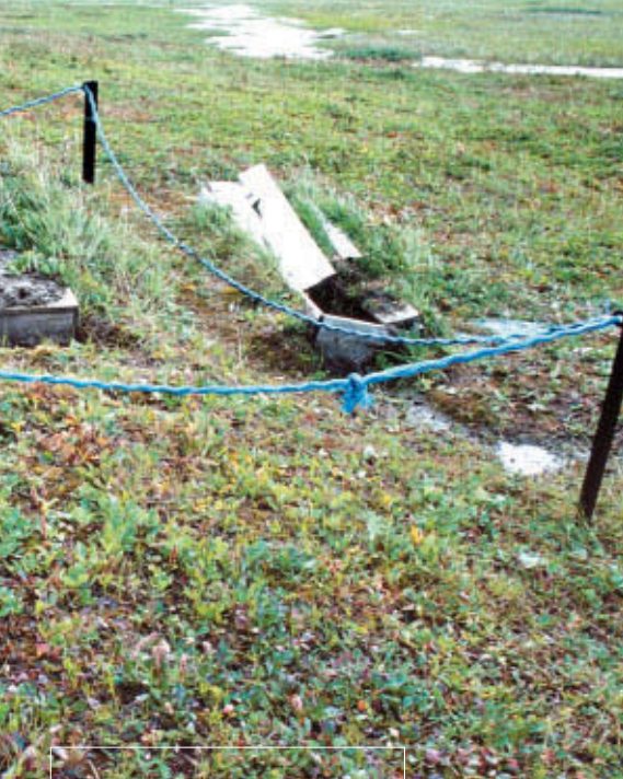
Melting permafrost is exposing graves and cultural resources at Herschel Island.