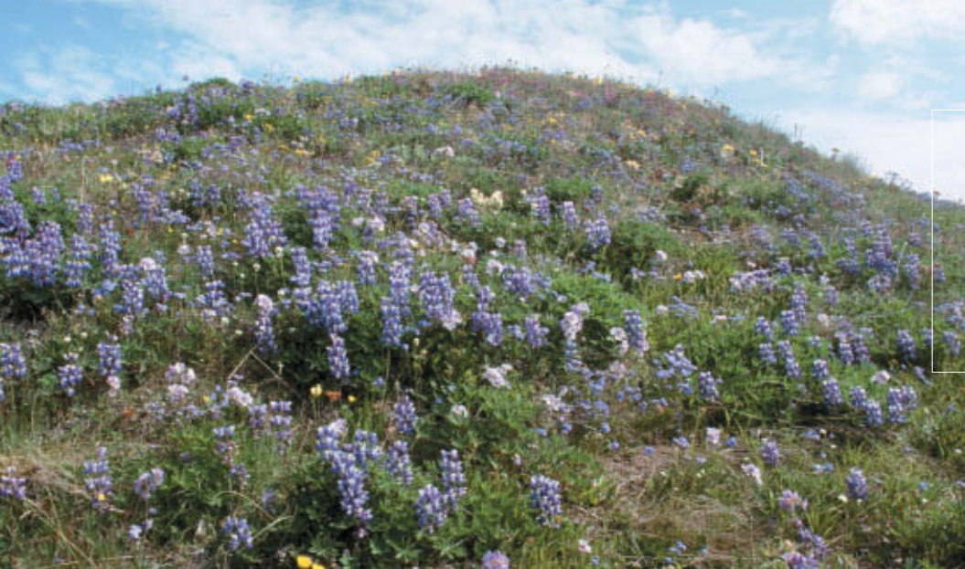
Arctic Lupine covers a knoll on Herschel Island. Vegetation change in Yukon is one impact of climate change.