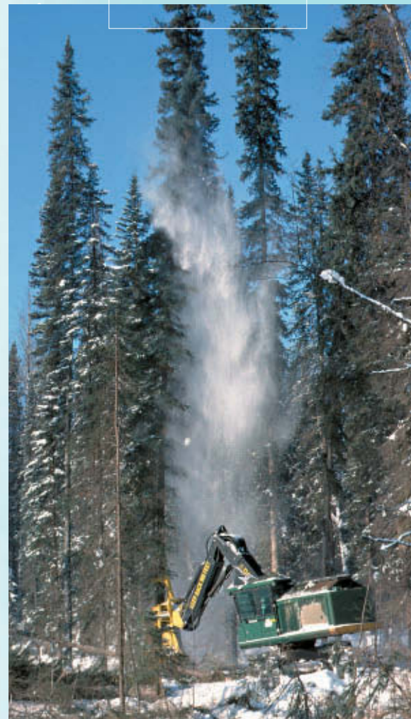
Logging near Watson Lake.