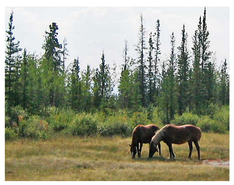
Grazing by horses can impact wetland areas.

Lands Department management and policy development Little Salmon/Carmacks First Nation (high, years | to 2)