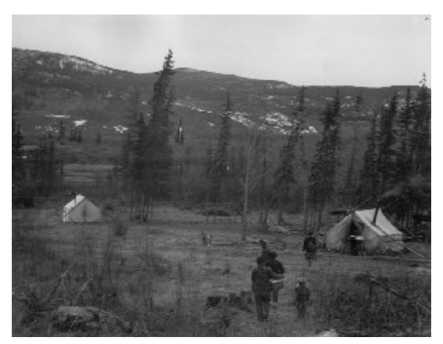
Six Miles Camp, Carmacks, 1960s. Yukon Archives PHO 372 88/151 YA#28