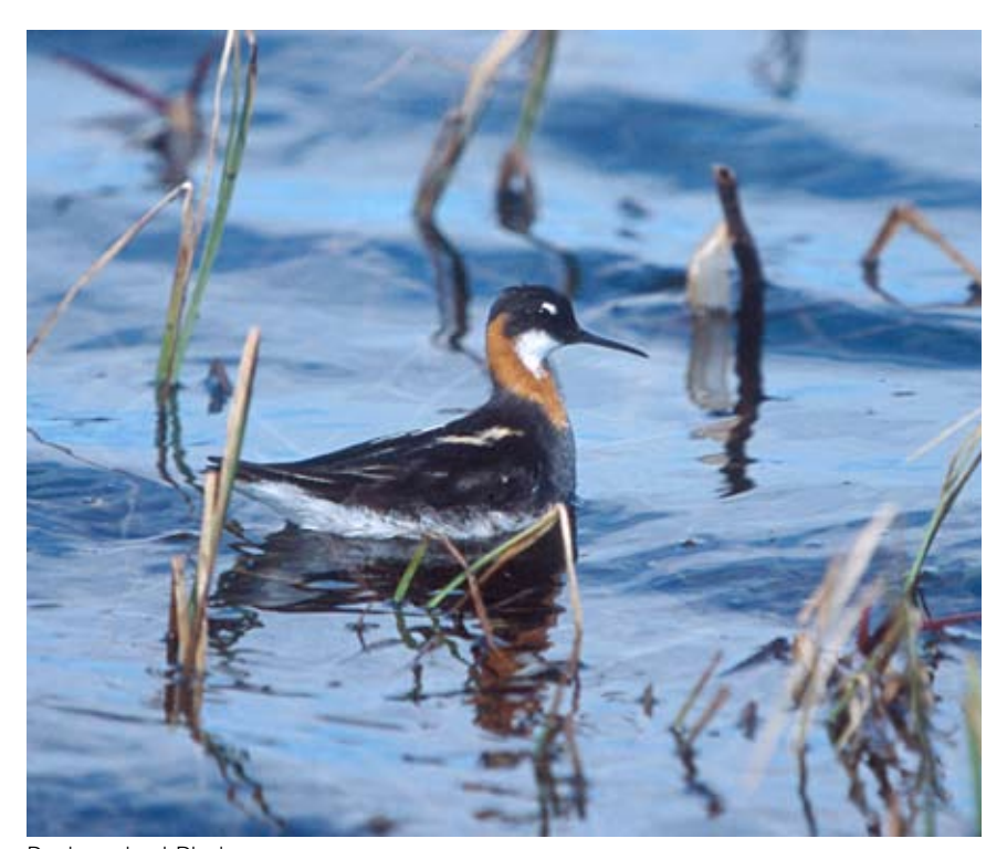
Red-necked Phalarope. Cameron Eckert

Little Salmon/Carmacks First Nation and Government of Yukon (low, years 4 to 5)