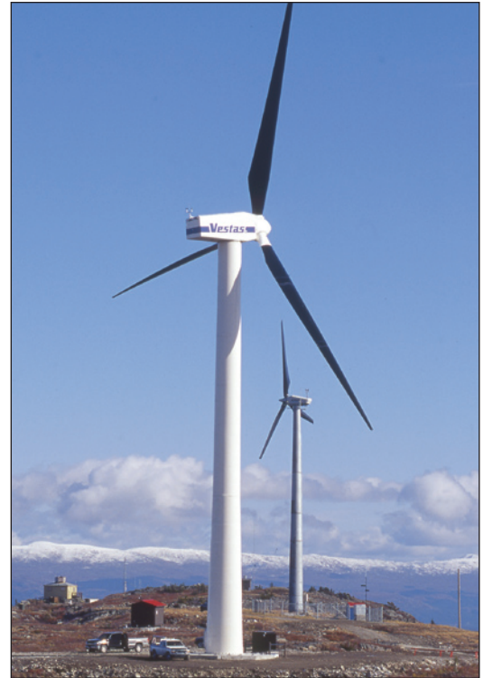
These wind turbines are located on Haeckel Hill, near Whitehorse. In the Yukon, commercial wind turbines currently provide enough electricity to displace 994 tonnes of CO 2 e annually.

Climate change may also hold opportunities for the Yukon private sector. For example locally pioneered renewable energy expertise with on-grid, off-grid and micro-grid projects, can be transplanted to other jurisdictions. Changes to the climate may also expand opportunities for agriculture and forestry.