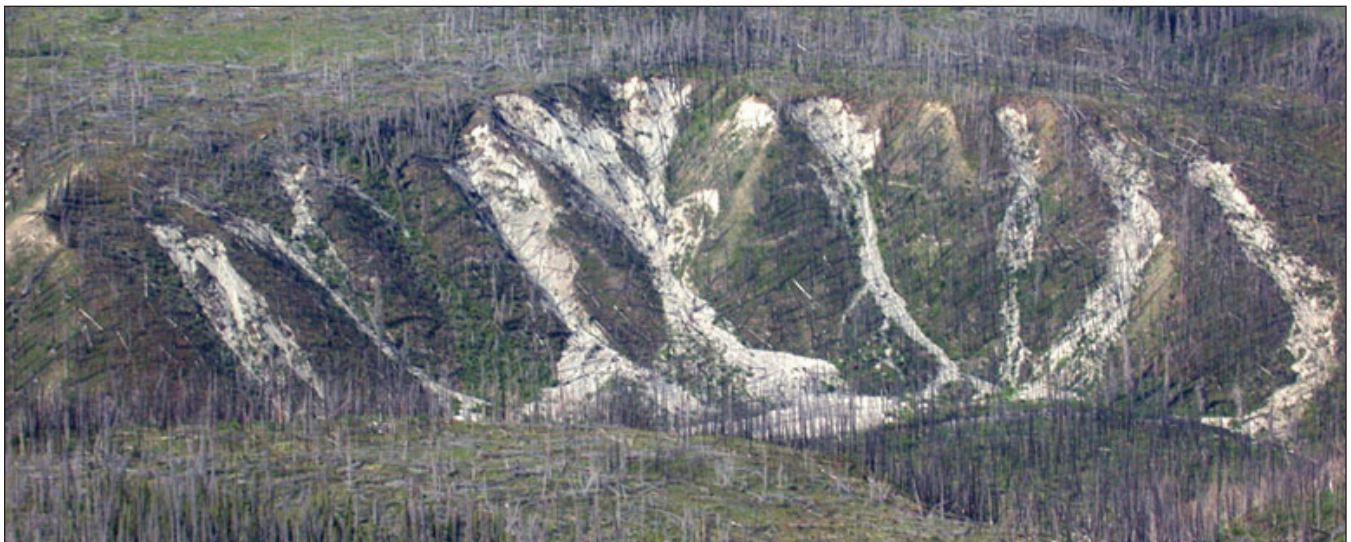
Marshall Creek, just east of Haines Junction. Forest fires in the area lead to permafrost thaw which triggered numerous landslides into a small drainage basin. Similar activity has recently been noted in other parts of the Yukon after forest fires (particularly Dawson City after the 2004 fires). More of this type of activity can be expected if the number and severity of forest fires increases with climate change as has been predicted.