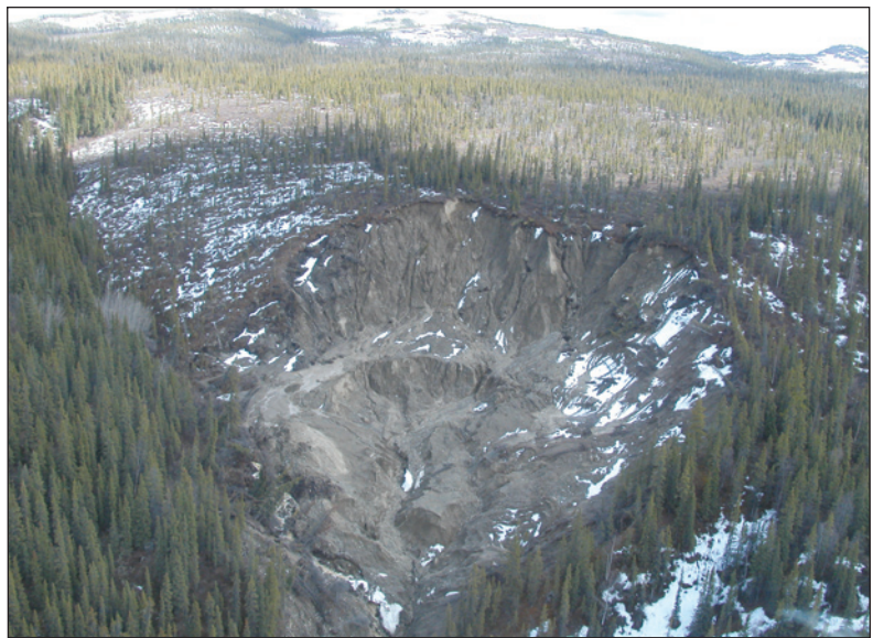
Large landslide that developed on a hillside 15 km southeast of Carmacks and travelled downstream over 4 km in a highly destructive debris flow, nearly blocking the North Klondike Highway.

The Yukon government will pursue the implementation of its Climate Change Strategy in partnership and collaboration with First Nation governments, municipalities, industry, the public, the other northern territories and the provinces, the federal government and other governments around the world. It is prudent for the Yukon government to join with others to take action on climate change and to ensure that climate change in the north is an issue that is addressed effectively.