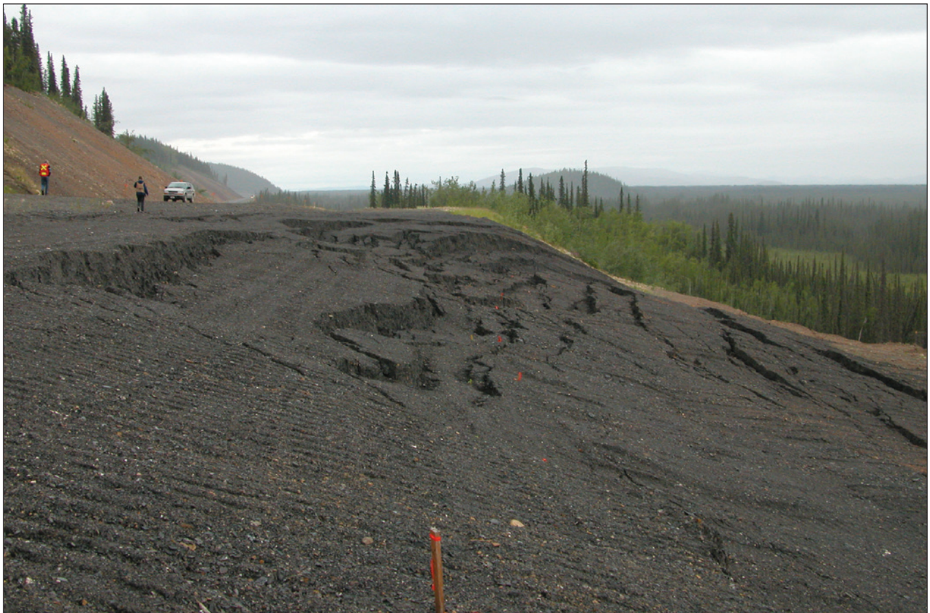
Subsidence of road fill along the Alaska Highway near Beaver Creek caused by permafrost thaw beneath fill. The failure is not directly linked to climate change — rather it was caused by disturbance of groundwater flow pathways which has led to permafrost thaw at this site. But it is representative of the type of failures that could occur along highways as permafrost starts to thaw more.