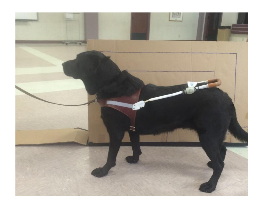
Image 3: A guide dog is standing in front of a signage replica outlining the dimensional guidelines for guide dogs.

It is our opinion that these size guidelines should be eliminated given that every seat on modern aircraft are virtually identical. Instead, travellers should be provided with a choice based on their unique needs, as to the nature of the accommodation for their guide dog. While some may require an additional seat given health concerns and the size of their guide dog, others may be adequately accommodated, provided they are able to be seated in specific seats. For instance, certain Airbus aircrafts have a row with two seats instead of three. The additional space, not large enough for a third seat is ideal for a guide dog. The overarching objective in providing suitable and reasonable accommodations for travellers with guide or service dogs should be the safety of both the traveller and their guide/service dog, dignity and comfort of the traveller as well as their fellow passengers.