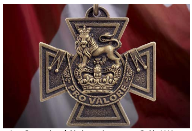
A Canadian version of this decoration was unveiled in 2008; however, it has not been awarded in Canada since the Second World War.