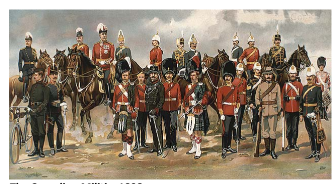
The Canadian Militia, 1898.

The history of the Canadian Armed Forces begins with the militia, in colonial times. At Confederation in 1867, who was the commander-inchief of the Land and Naval Militia?