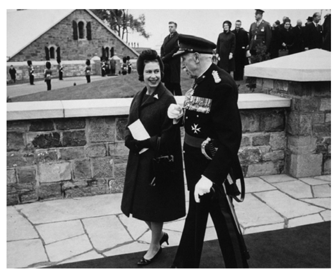
I visited the Citadelle of Québec with Her Majesty The Queen in 1964.