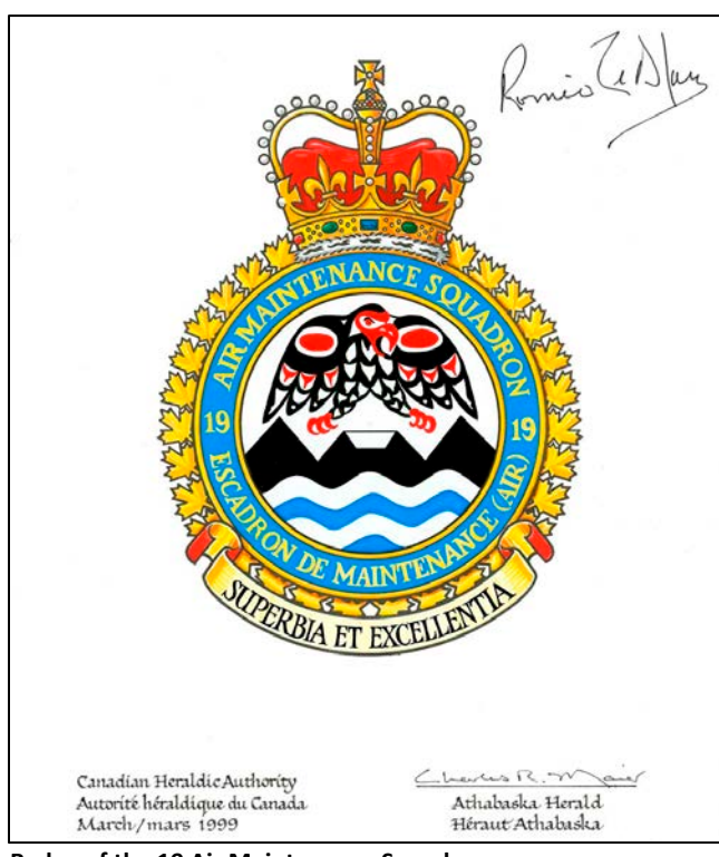
Badge of the 19 Air Maintenance Squadron.