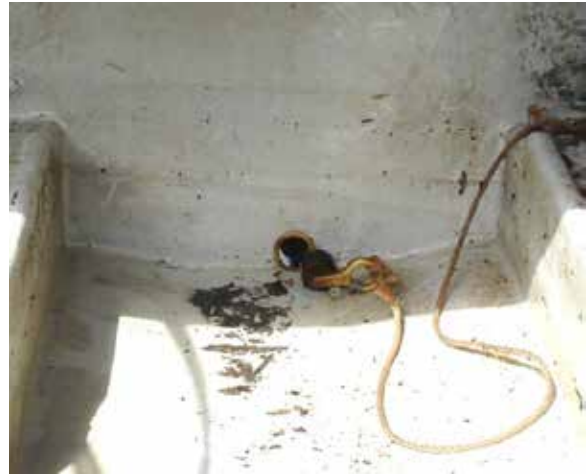
Photo 2. Drain hole and removable plug

The vessel carried a lifebuoy, flares, and 4 personal flotation devices (PFDs) that were stowed on hooks on the port side of the deckhouse. A very high frequency (VHF) radiotelephone with a digital selective calling (DSC) feature was also carried on board.