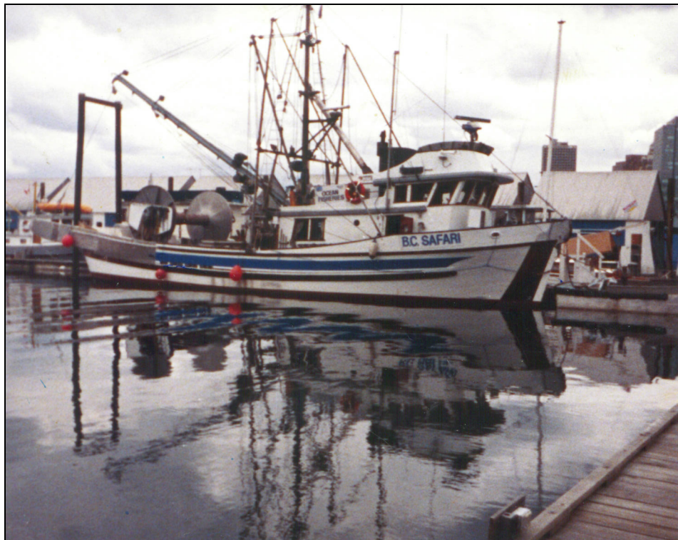
Photo 1. The B.C. Safari

Abaft the superstructure was the main working deck with three raised hatch coamings and a net drum on the centreline. An aluminum tilt ramp extending approximately 2 m beyond the stern was attached to the fir timbers. The B.C. Safari was originally built for salmon seining, but at the time of the accident it was being used as a fish packer to transport herring from the fishing grounds to another vessel that would then be used to transport the fish product to a processing plant on shore.