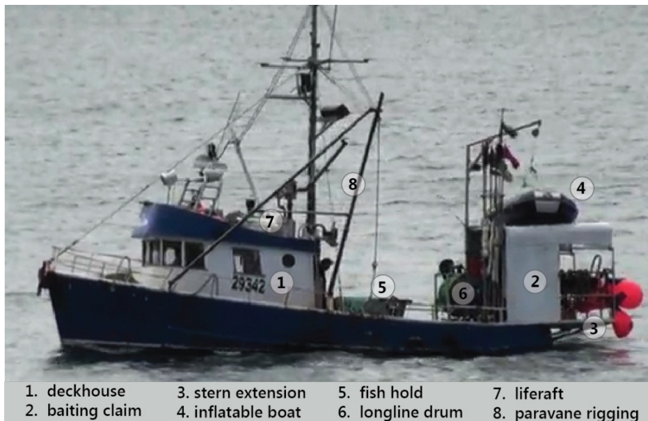
Photo 1. The Pacific Siren's general arrangement.

The vessel carried a 4 m recreational inflatable boat secured to the top of the baiting claim and a 4-person liferaft located on top of the deckhouse. The vessel also carried 2 lifejackets stowed in the galley, 4 immersion suits stowed in a locker on the port aft side of the deckhouse, and 1 personal flotation device (PFD) stowed near the longline drum on the main deck. The vessel was equipped with a pair of outrigger booms rigged with roll-dampening paravanes.