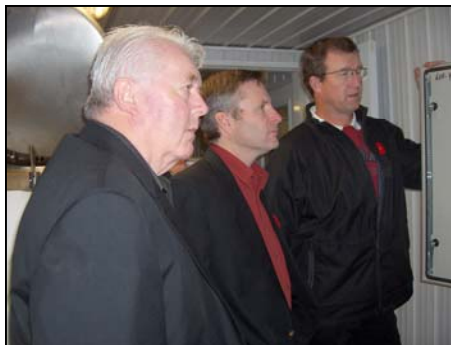
Members of the committee tour an oilseed extraction plant.

The committee also continued its review of the implementation and potential impact of a province-wide ban on the use of cosmetic lawn pesticides, submitting its recommendations to the Legislative Assembly on April 22, 2008. Throughout the public consultation phase of the committee's consideration of this topic, a great deal of public interest was evident, with a total of 227 submissions received from groups and individuals. Additionally, on two occasions, committee members participated in tours, visiting an oilseed extraction facility and a cranberry bog to observe the start of the harvest.