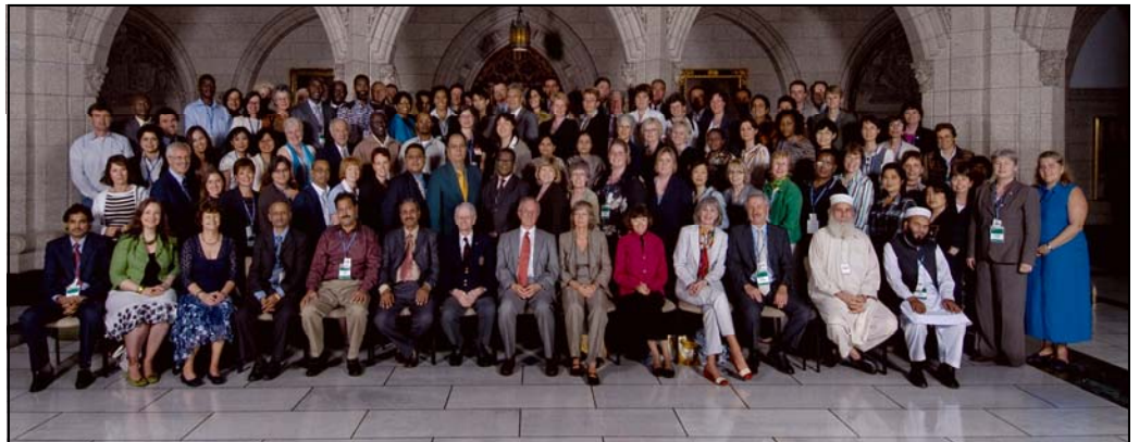
International delegates to the 24th Annual Conference of Library and Research Services to Parliamentarians.

As the library continues to add to its collection and to the professional development of its staff members, I look forward to the dynamic future of the Legislative Library of Prince Edward Island.