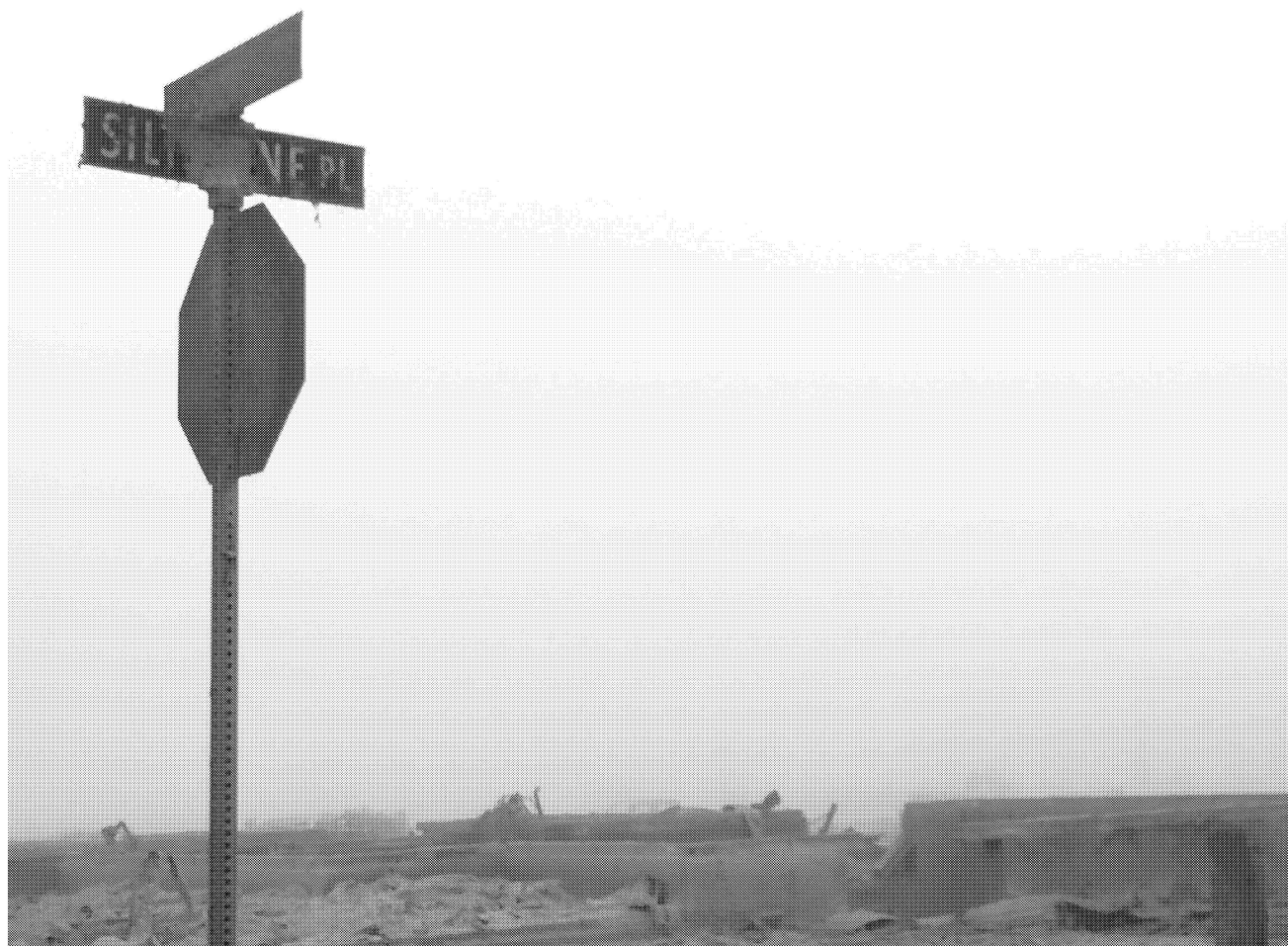
The intersection at Prospect Drive and Siltstone Place in Timberlea, Fort McMurray, Alberta.

The Federal Court of Appeal hearing on merging the two Radio-Canada bargaining units into one is scheduled for September 13, 2016. In the meantime, negotiations with the two bargaining units continue.