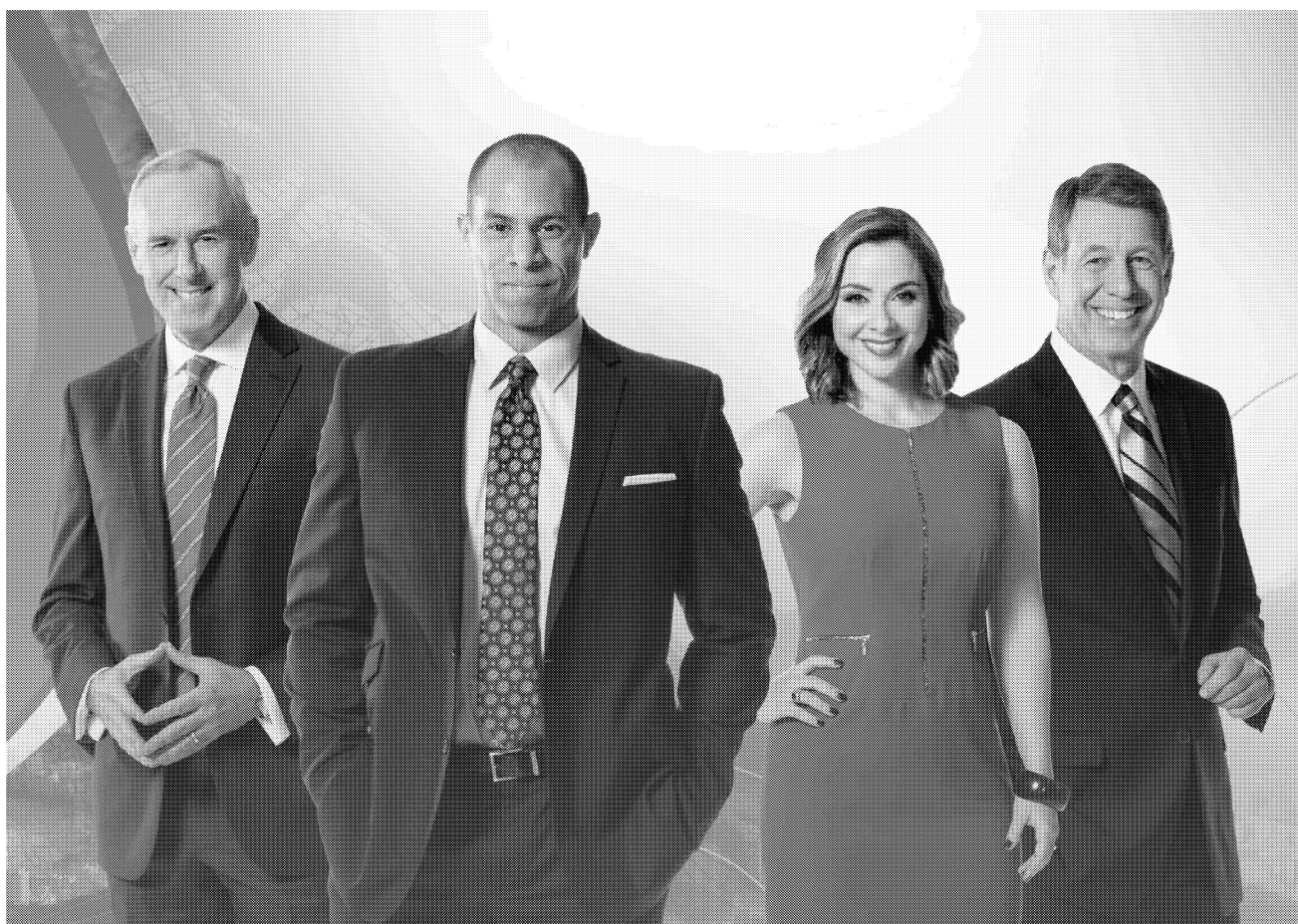
Ron MacLean, David Amber, Andi Petrillo, Scott Russell, hosts of CBC Olympic Games coverage