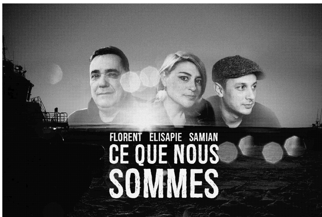
Ce que nous sommes , ICI Musique