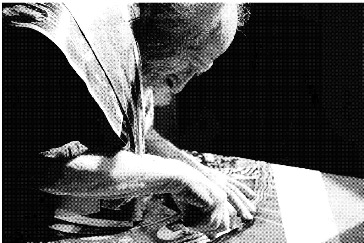
Billsville, featured on the newly launched CBC Short Docs

Revenue – Although early in the year, results to date are trending consistent with achievement of the annual target.