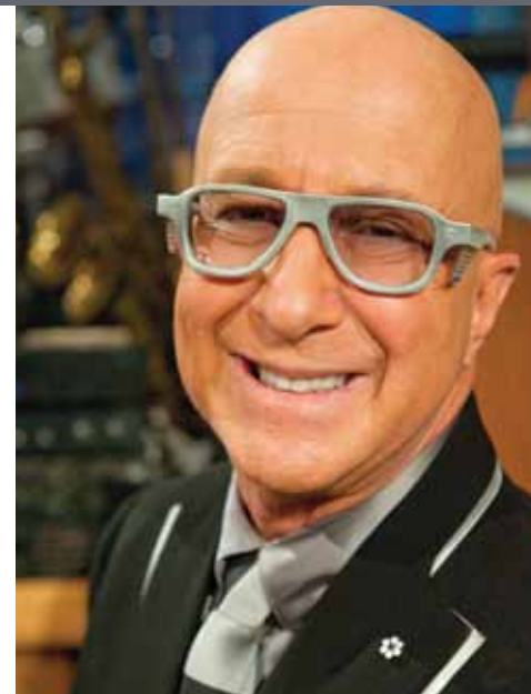
Canadian musician and composer Paul Shaffer, C.M., wears his pin nightly on "The Late Show with David Letterman."