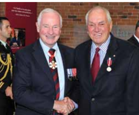
His Excellency presents the Diamond Jubilee Medal to the Honourable Ed Broadbent, on September 10, 2012.