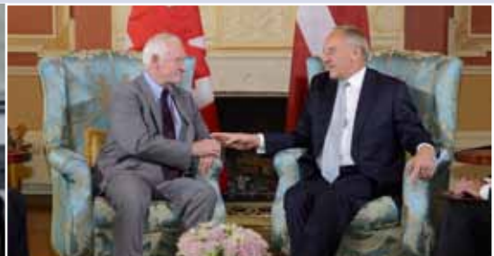
In September, as part of a working visit to Canada, His Excellency Andris Berziņš, President of the Republic of Latvia, met with the Governor General.