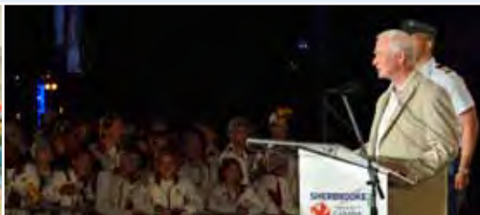
In August, the Governor General officially closed the 2013 Canada Summer Games in Sherbrooke, Quebec.