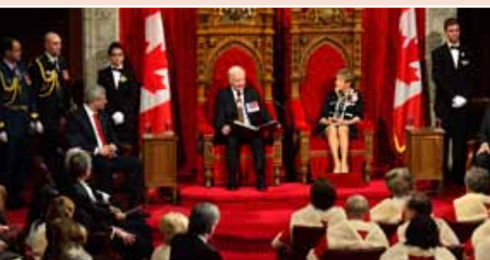
The Governor General read the Speech from the Throne in the Senate on October 16, 2013.