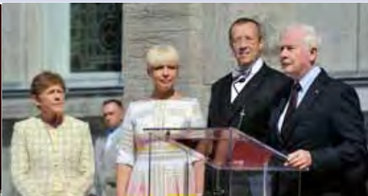
In May, His Excellency Toomas Hendrik Ilves, President of the Republic of Estonia, and Mrs. Evelin Ilves, began their State visit to Canada.