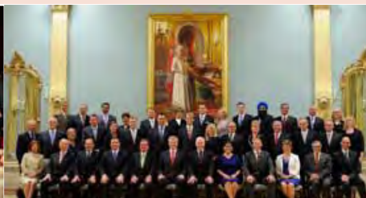
On July 15, 2013, His Excellency presided over the swearing-in of the Canadian Ministry.