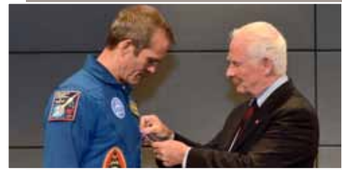
On June 27, 2013, the Governor General presented Chris Hadfield with the Meritorious Service Cross (Civilian Division.)