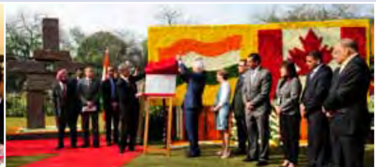
In February, Their Excellencies unveiled and presented an inuksuk to the people of India on behalf of the people of Canada; the gift symbolizes the friendship and co-operation between both countries.

In 2013-2014, the Office supported Governor General David Johnston as he represented Canada abroad, visiting eight countries.