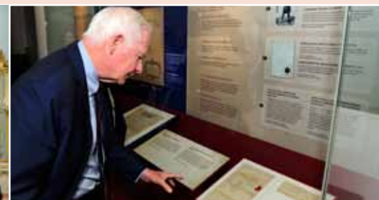
The Governor General had the opportunity to examine the Royal Proclamation of 1763, which was on display at the Canadian Museum of Civilization, in October.