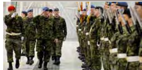
As commander-in-chief of Canada, His Excellency inspected the guard of honour upon his arrival at 4 Wing Cold Lake, on March 28, 2014.