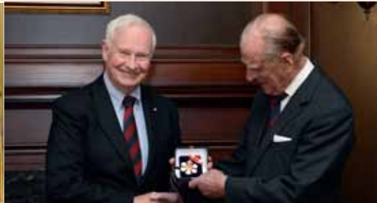
During a visit to Toronto in April, His Excellency presented the insignia of Companion of the Order of Canada to His Royal Highness The Prince Philip, Duke of Edinburgh.