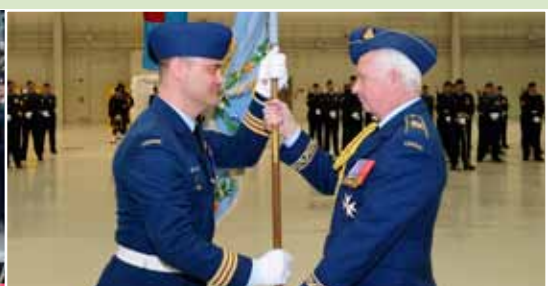
In June, His Excellency had the opportunity to recognize those who served in the Korean War.