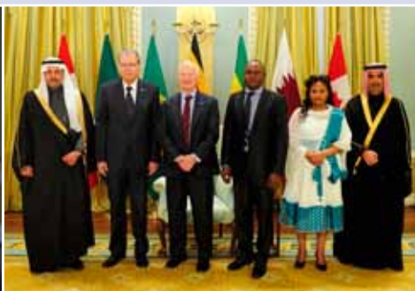
On January 28, the Governor General received the credentials of four ambassadors (Saudi Arabia, Brazil, Ethiopia and Qatar) and one high commissioner (Uganda).