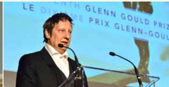
In March, Robert LePage, C.C., O.Q., was awarded the Tenth Glenn Gould Prize at Rideau Hall, in recognition of his artistic excellence and lifetime devotion to the arts.