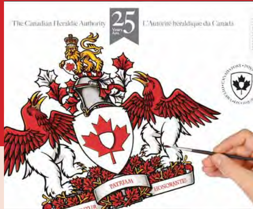
Canada Post marked the 25 th anniversary of the Canadian Heraldic Authority with a commemorative envelope featuring the Authority's armorial bearings.

His Excellency the Right Honourable David Johnston June 4, 2013