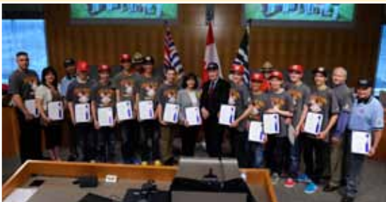
During a visit to Vancouver in June, His Excellency presented the Caring Canadian Award to the Langley Little League team for their community service during the 2012 Pearl of Africa Series.