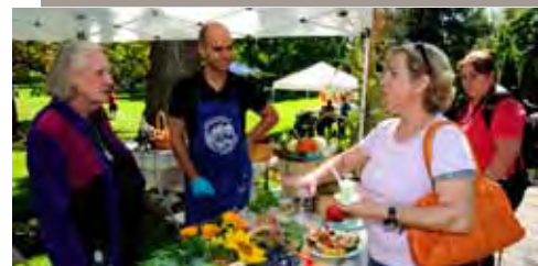
On September 28, 2013, more than 8 000 harvest and food enthusiasts participated in Savour Fall at Rideau Hall.