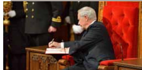
On December 12, 2013, His Excellency granted Royal Assent to various bills on behalf of The Queen during a traditional ceremony held in the Senate.