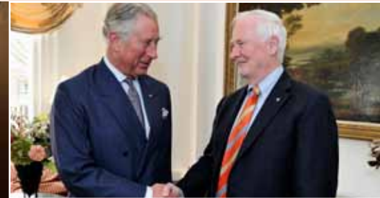
In April, while in Amsterdam to attend the investiture ceremony of His Majesty King Willem-Alexander, His Excellency met with His Royal Highness The Prince of Wales.

In 2013-2014, close to 100 activities associated with representing the Crown in Canada were supported by the Office.