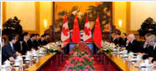
In October, the Governor General met His Excellency Xi Jinping, President of the People's Republic of China, and discussed issues of mutual interest to both countries.