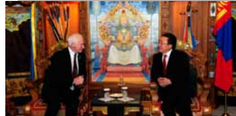
During his State visit, the Governor General met with the President of Mongolia in the State Ger of the State Palace, in the capital city of Ulaanbaatar on October 25, 2013.