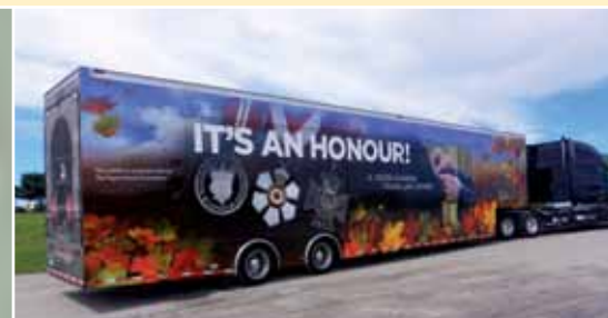
The It's An Honour! mobile exhibit began travelling across Canada on July 31. Made possible by the generosity of The Taylor Family Foundation, the exhibit features interpretative panels, multimedia elements and artifacts, providing an opportunity for visitors of all ages to learn more about the Canadian Honours System and some of its recipients.