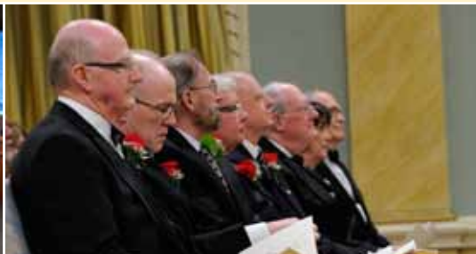
In April, five laureates were presented with the 2013 Killam Prizes. Administered by the Canada Council for the Arts, these prizes are awarded annually for the outstanding career achievements of Canadian scholars.