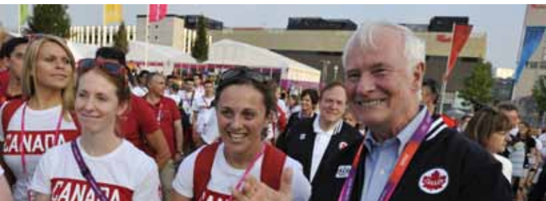
During the Canadian Olympic Team Welcome Ceremony on July 25, 2012, the Governor General met with athletes and wished them good luck.

Congratulations to all our members and to the whole Canadian Olympic Team for a job well done!