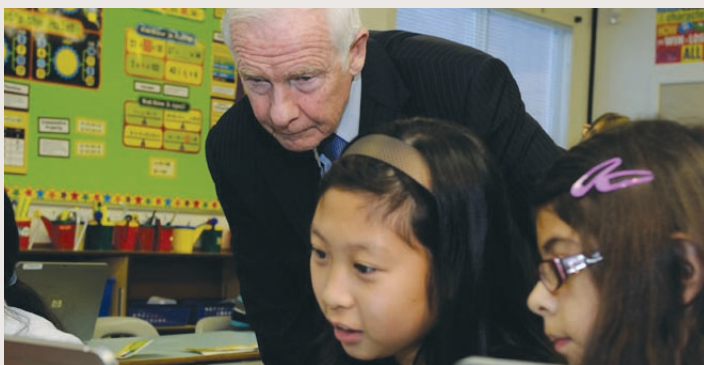
St. Mary Professional Learning School, Calgary, Alberta, November 29, 2010. The school launched a pilot project in 2009, where students use computers to improve their learning methods.

“Life itself is a constant series of lessons; whether we are at school, at home or at work, we are constantly learning. Similarly, our lives are spent thinking of new ways to do old things, seeing things differently and succeeding where others have not. By promoting education and innovation—in schools, government, business or charitable organizations—and by reaching our full potential, we can achieve any goal we set out to accomplish as a nation.”