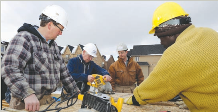
Habitat for Humanity construction project, Toronto, Ontario, January 14, 2011. The Governor General lends a hand to help the Westin Road neighbourhood.