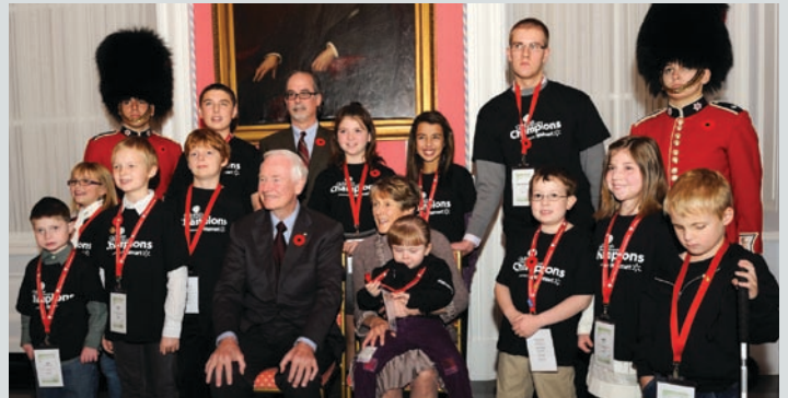
Reception for the Children’s Miracle Network 2010 Champions at Rideau Hall, on November 7, 2010. The reception honoured remarkable children who have triumphed over severe medical challenges.