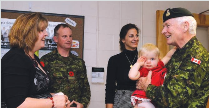
The Military Family Resource Centre at CFB Gagetown in Oromocto, New Brunswick, on November 9, 2010. Their Excellencies visited with military family members who benefit from the centre.

“By supporting families and children, we ensure that Canada’s future is secure. Families are vital to the growth of this nation, regardless of background or circumstances. By ensuring children have the opportunity to develop and succeed, by giving aid to families in need, and by showing our support, we are creating a bright future for our country.”