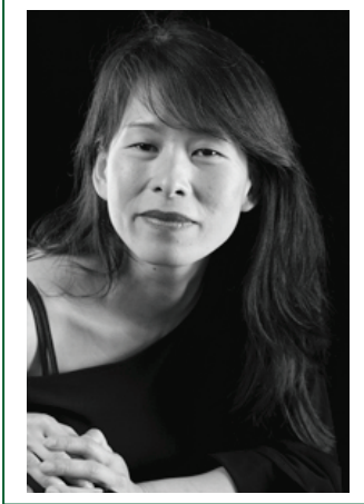
Kim Thúy Author

As part of the exodus of Vietnamese boat people, Kim Thúy fled Vietnam when she was 10 years old. She has worked as a seamstress, an interpreter, a lawyer, a restaurant chef/owner, and a guest chef on various radio and television programs. ru , her first novel, was published by Libre Expression in October 2009, with the rights subsequently sold to 20 countries worldwide. Ms. Thúy is the recipient of a 2010 Governor General's Literary Award, the Grand Prix RTL/Lire 2010, and the Grand Prix du Salon du Livre de Montréal 2010. She was also a finalist for other literary prizes. She currently resides in Montréal.