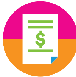
Curriculum development funds