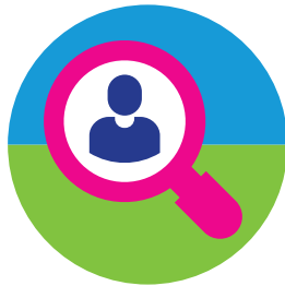
Recruiting faculty from "non-traditional" disciplines