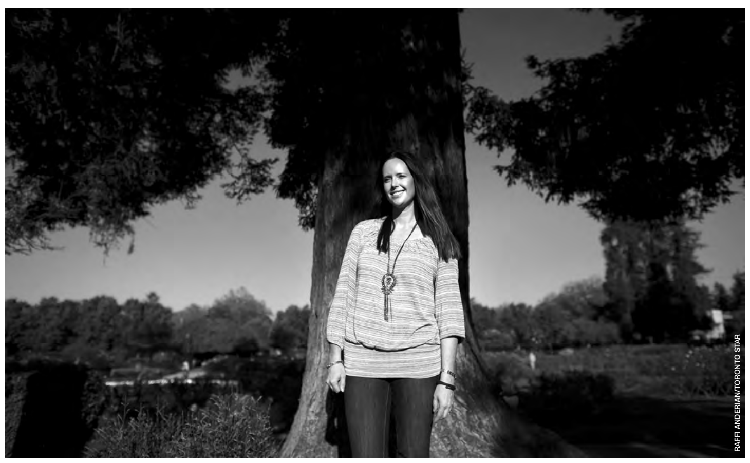
The problem is very public, but the solution is still veiled in secrecy.

She's the image of poised perfection: a come-hither blonde in a sexy gold dress, balancing a martini between polished red nails, painted just a shade darker than the swizzle stick perched jauntily through the "o" in "Classic Cocktails" above her head.