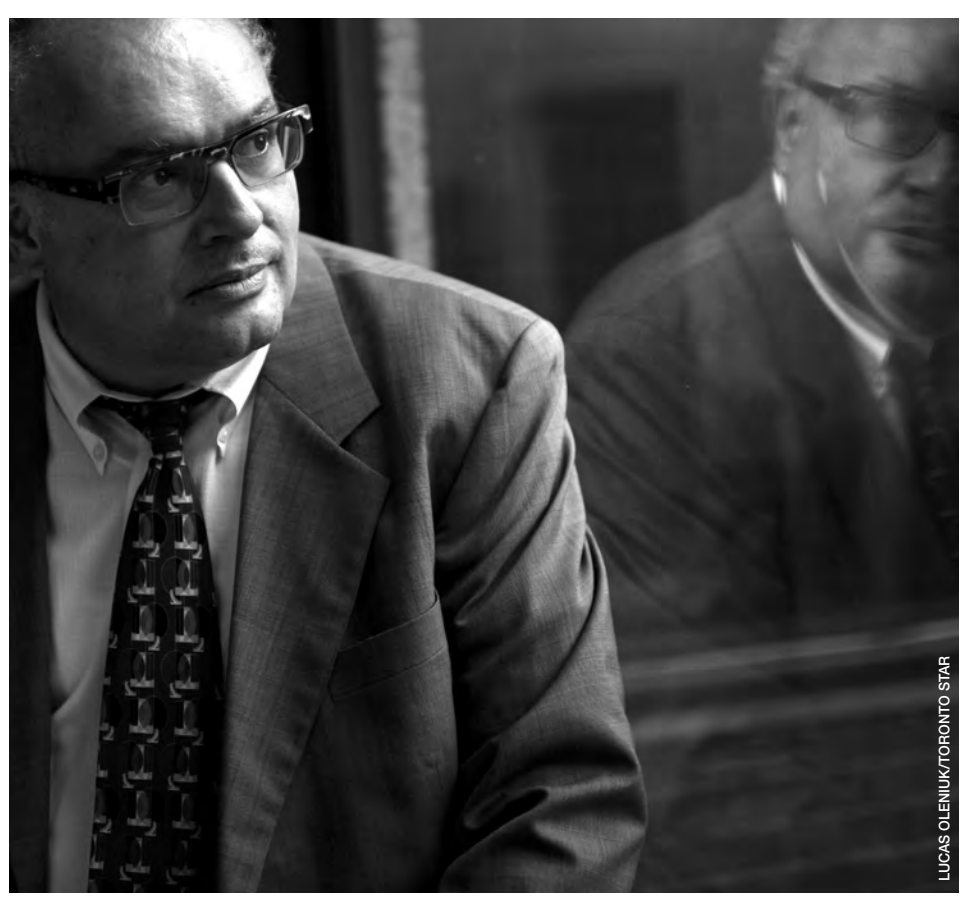
Jürgen Rehm says the richer the country, the more women drink.

When it comes to alcohol, we live in a culture of denial. With alcoholics representing roughly two per cent of the population and more than 80 per cent of us drinking, it's the widespread normalization of heavier consumption that translates to a national health burden. The top 20 per cent of the heaviest drinkers consume 73 per cent of the alcohol in Canada. Episodic binge drinking by a large population of nondependent drinkers has a huge impact on the health and safety of the community. That larger group is well represented in the numbers missing work, getting injured or being hospitalized. When