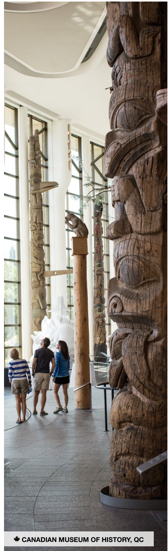
🍁 CANADIAN MUSEUM OF HISTORY, QC

http://en.destinationcanada.com/ctc-media-contacts