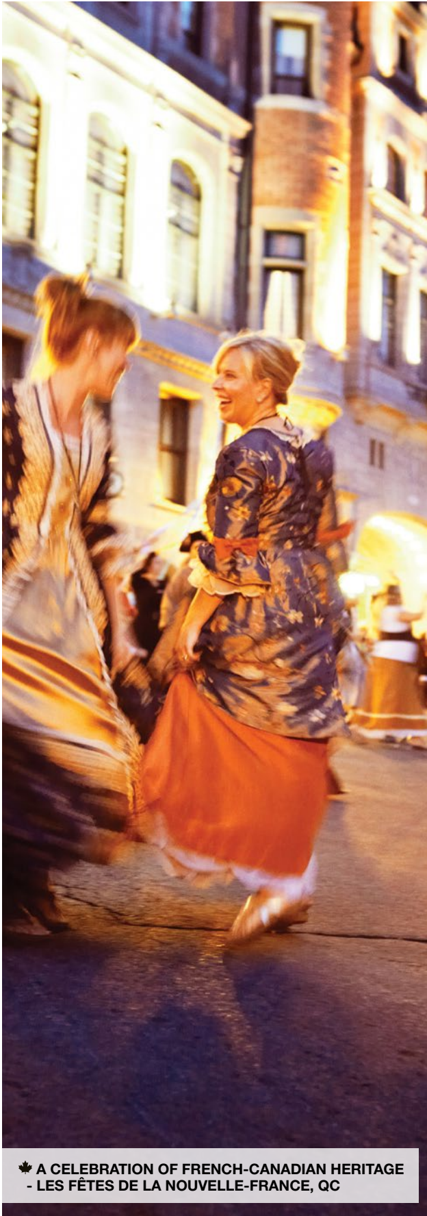
🍁 A CELEBRATION OF FRENCH-CANADIAN HERITAGE - LES FÊTES DE LA NOUVELLE-FRANCE, QC

Editors and reporters focused on the travel trade are producing content specifically for people who work in the tourism industry, including travel agents, tour operators, tour wholesalers, hotel companies, attractions, airlines and other transportation providers, marketers and DMOs.