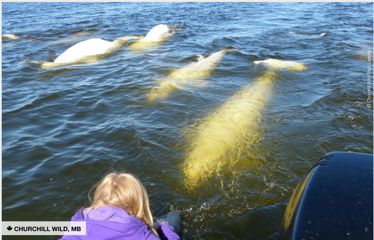
🍁 CHURCHILL WILD, MB