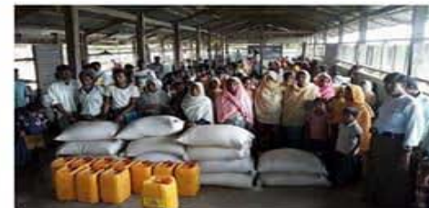
Muslim communities with aid provided by the Government