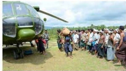
Airlift for humanitarian aid