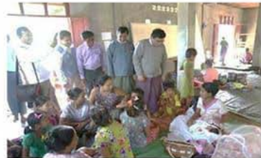
Union Minister providing emergency relief assistance and psycho-social support