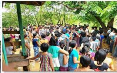
Visit to children from Nant Thar Taung charity school