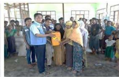
Emergency food assistance to Muslim communities