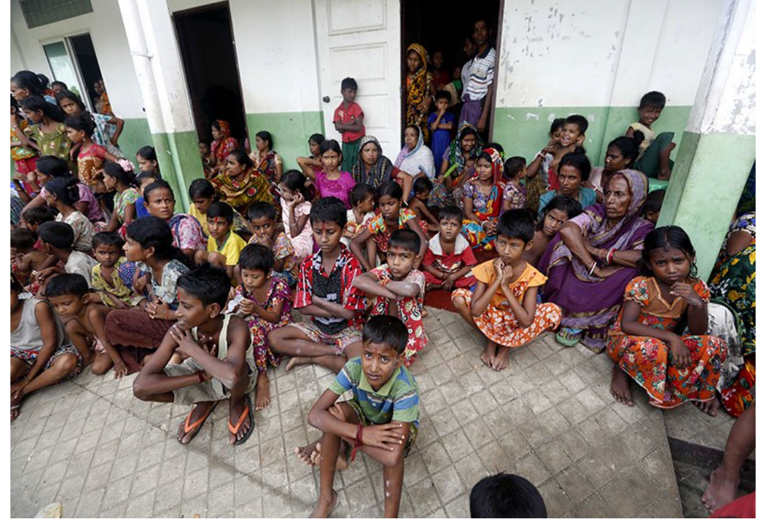
Twenty eight minority Hindu bodies were unearthed in Rakhine State's Maungdaw Township on September 24.