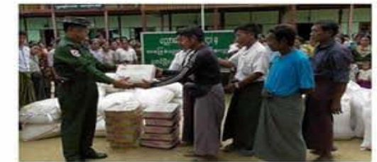
Local military providing aid to affected communities