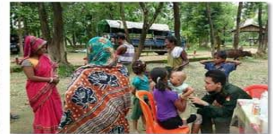
Medical care to Hindu communities