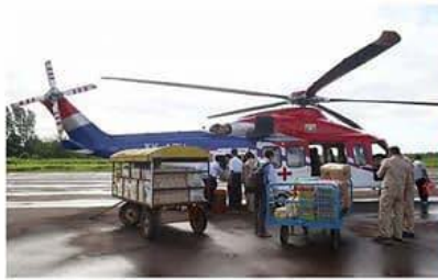
Airlifting humanitarian assistance for affected communities