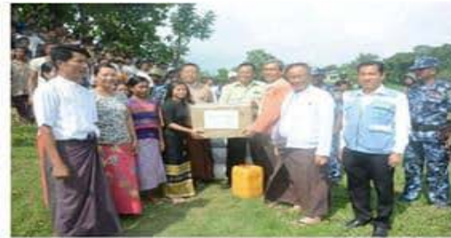
Aid provision by Rakhine State's Chief Minister