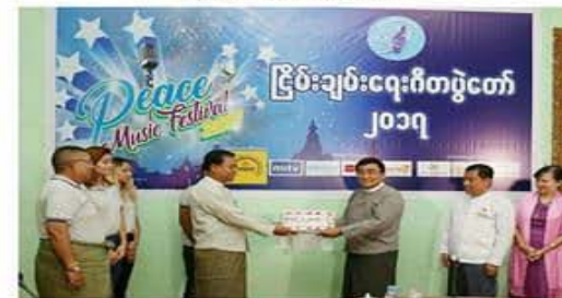
Donation from local well-wishers for humanitarian relief in Rakhine