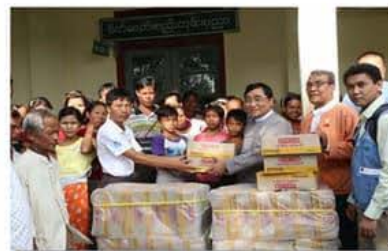
Emergency food assistance to affected communities in Taungpyoletwe, Maungtaw