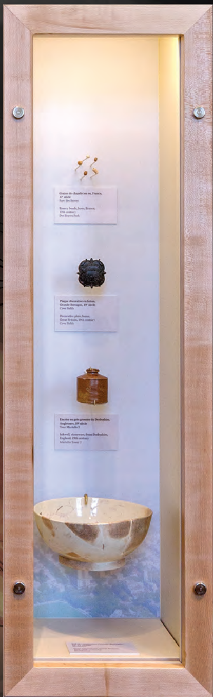
Chaîne de chapelet en or, France, 17 e siècle Père des Bruns Bouton de bouton, Paris, France, 18 e century Des Bruns Pich