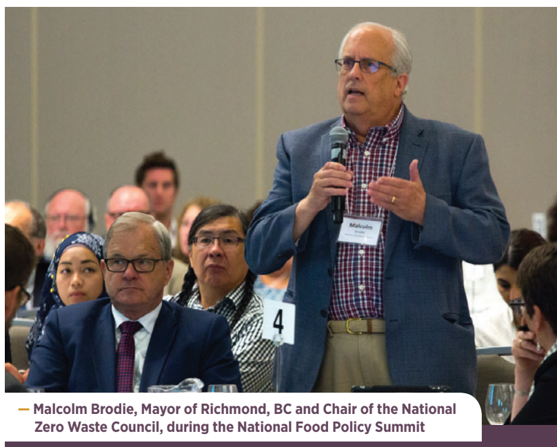
— Malcolm Brodie, Mayor of Richmond, BC and Chair of the National Zero Waste Council, during the National Food Policy Summit

Participants expressed strong concerns about the contribution of food loss and waste to greenhouse gas emissions, which in turn contribute to climate change. Some indicated that success in reducing food loss and waste could help Canada meet its commitments to reduce greenhouse gas emissions under the Pan-Canadian Framework on Clean Growth and Climate Change, and could contribute to achieving