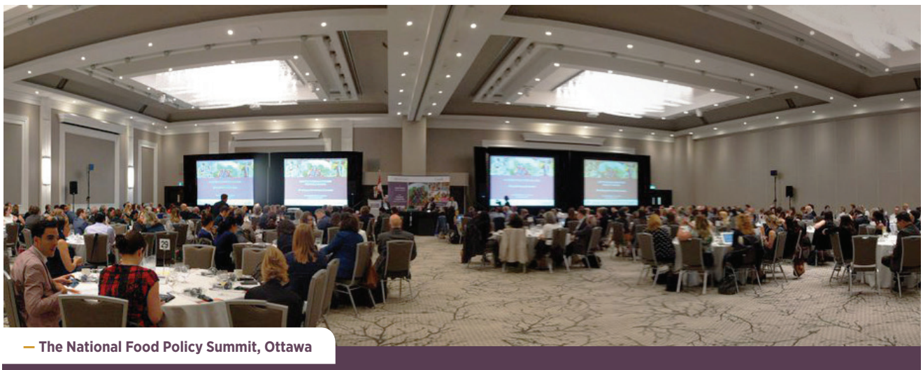
— The National Food Policy Summit, Ottawa

With this in mind it is important to note that input was wide-ranging, broad-based, and not always consistent. The report aims to reflect the essence of the ideas and perspectives that were raised during the consultation process but does not attempt to include every comment received and it does not intend to imply consensus on the part of all participants. It presents a summary of what was heard from consultation participants – key messages, perceptions, and suggestions for the food policy. The views expressed are those of participants in the consultation process and should not be construed as representative of the Government of Canada's positions or views.