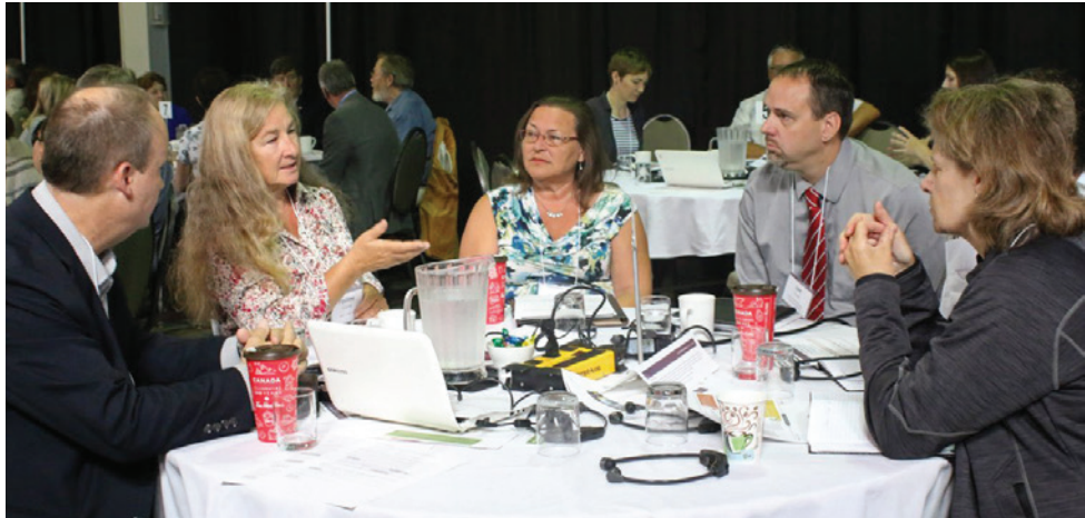
Charlottetown regional food policy consultation

Some input received indicated that sustainable growth helps to build public trust of the agriculture and food industry. In separate consultations on the Canadian Agricultural Partnership, the agriculture and food sector also indicated that building public trust should be a key focus in the next agricultural framework. The sector noted that: while public trust is slow to build, it can be eroded very quickly; consumer education and awareness activities are critical to building public trust; and programming should be reflective of this important need.