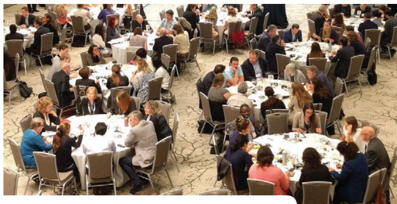
— Table discussions during the National Food Policy Summit

Summit participants expressed broad support for the elements included in these draft statements. They emphasized the importance of including people, systems and leadership in a vision statement, along with food security and protection of the environment. They also signalled that the policy's vision statement should acknowledge the importance of culturally-appropriate food, encompass all parts of the food system, and recognize the linkages among food, health, the environment, and economic growth.