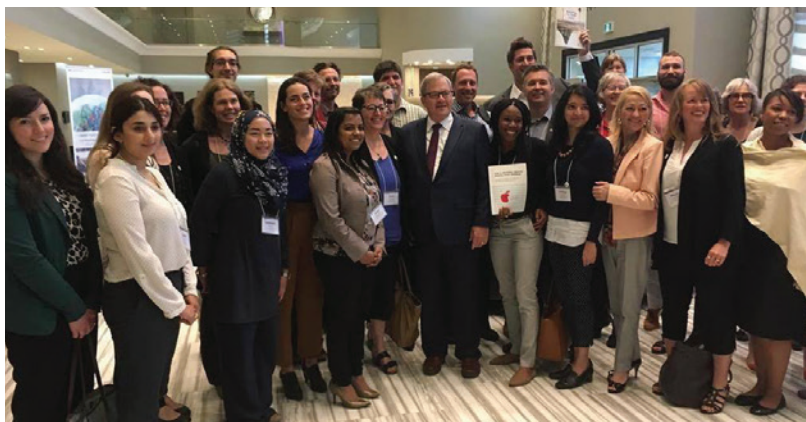
Minister Lawrence MacAulay with participants at the National Food Policy Summit

Some participants noted that the cost of food in Canada relative to income is comparatively low on a global scale. There were mixed views on the use of the term “affordable” in this theme. Some stakeholders felt that pursuing affordability of food could either impede production of food or the ability of farms and food businesses to earn reasonable profits. Although affordability was seen as extremely important by some participants, especially those from isolated, northern communities,