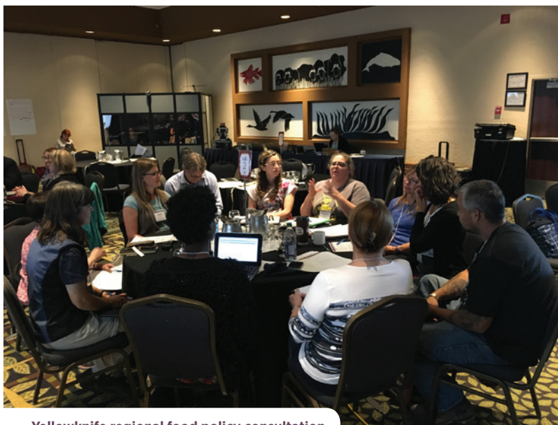
— Yellowknife regional food policy consultation

Participants emphasized the importance of community-led and community-based approaches to food insecurity for all regions and communities in Canada, including urban areas. Many participants indicated that local residents are best placed to identify their community needs, and referred to specific community-led solutions currently underway across Canada as best practices. These initiatives often have additional benefits, such as hands-on education, and linkages to food literacy and economic development. Participants perceived a need for these solutions to be supported, including through the sharing of best practices with other regions experiencing similar issues.