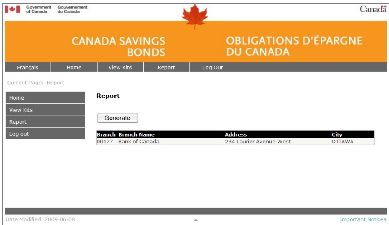
Figure 7: Report page

To download the report, select the Generate button and open or save a copy of the Excel file.