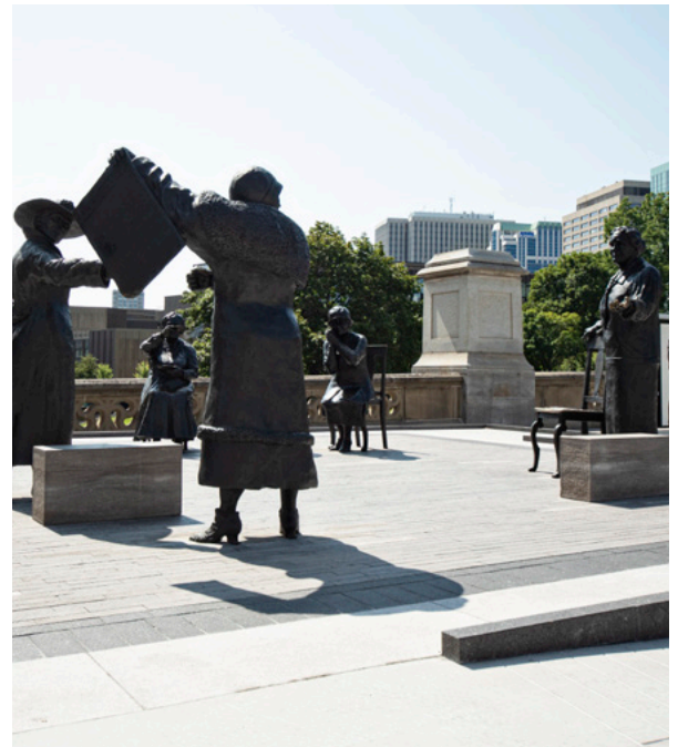
The “ Women are Persons! ” monument

Now, women play key roles in guiding the deliberations of the Senate. The Red Chamber remains a forum for senators to fulfil the vow Muriel McQueen Fergusson made when she first took her place in the Chamber: “If I can be of help to women in getting justice, I will.”