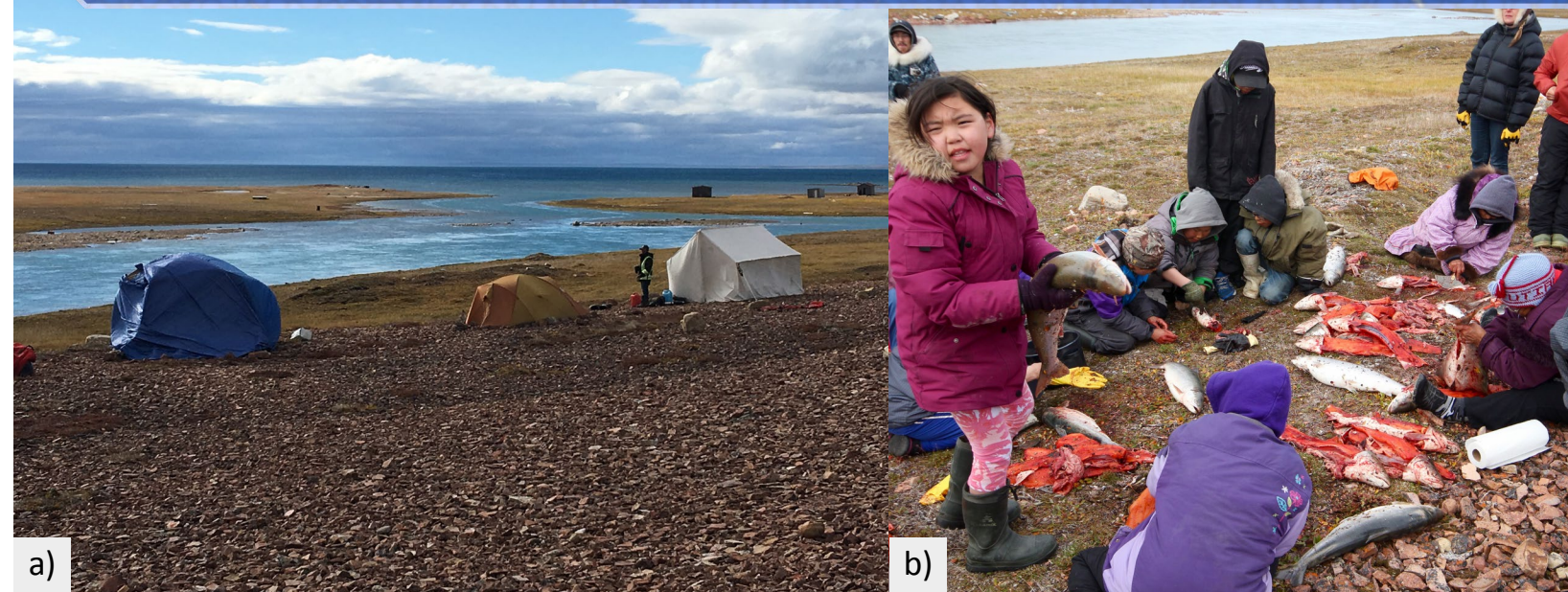
Figure 2: The Iqaluktuuq Elder-Youth Camp. (a) The camp was located at the mouth of the Iqaluktuuq (Ekalluk) River, where it empties into Wellington Bay. (b) Participants process and prepare the day's catch.

While researchers provided the initial impetus to develop this project, the initiative only proceeded after community engagement took place and direction was given. A scoping phase was initiated by N. Thorpe in April 2015 through in-person meetings with the EHTO and community members (particularly Elders) to gauge