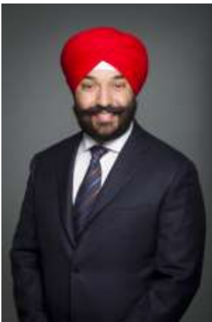
The Honourable Navdeep Bains Minister of Innovation, Science and Economic Development

It is my pleasure to present the Departmental Plan for the Atlantic Canada Opportunities Agency for 2017-18.