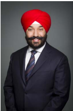
The Honourable Navdeep Bains Minister of Innovation, Science and Economic Development

It is my pleasure to present the 2018-19 Departmental Plan for ACOA.