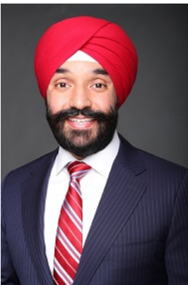
The Honourable Navdeep Bains Minister of Innovation, Science and Economic Development

Together with Canadians of all backgrounds, regions and generations, we are building a strong culture of innovation to position Canada as a leader in the global economy.