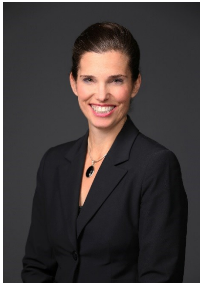
The Honourable Kirsty Duncan Minister of Science