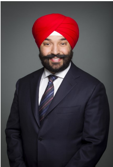
The Honourable Navdeep Bains Minister of Innovation, Science and Economic Development

It is our honour to present the 2015-16 Departmental Performance Report for the Atlantic Canada Opportunities Agency.