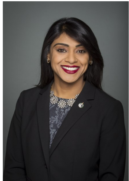
The Honourable Bardish Chagger Minister of Small Business and Tourism and Leader of the Government in the House of Commons