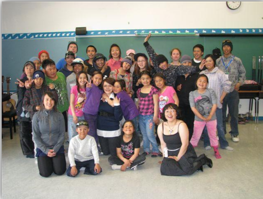
Participants of the Igloolik Music Camp, summer 2011.