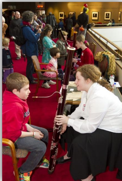
The activities of TUNETOWN supported by the Friends of the NAC Orchestra

A unique feature of the TD Bank Group Family Adventures series is the use of cameras on stage to project video images of the musicians onto a large on-stage screen that we affectionately call “NACOTron,” allowing the smallest members of the audience an “up close and personal” look at what’s happening on stage. NACOTron is presented in collaboration with Rogers TV which provides cameras and crew for each of the concerts.