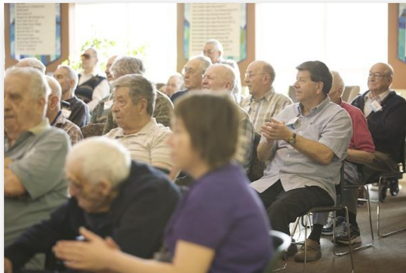
Performing for seniors in long-term care facilities.

During the 2010-2011 season, the NAC Orchestra partnered with the Health Arts Society of Ontario for a pilot project of 21 performances at four health care facilities in Ottawa between March and August 2011. The Health Arts Society of Ontario (also known as ArtsWay) is a new, not-for-profit organization dedicated to offering professional performances to people isolated in long-term care, particularly seniors. Together, ArtsWay and members of the NAC Orchestra provided patients isolated from the arts community the experience of enjoying performance arts in their own health care setting. Approximately 840 patients, their families and health care professionals alike were stimulated by these live 45-minute performances.