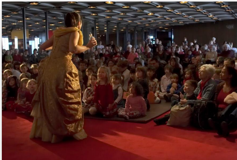
Young children and their families enjoying the NAC / Jeunesses Musicales of Canada's Kinderconcerts in the NAC's Panorama Room.

The popular Kinderconcert series, in its eighth season, offered four sets of quadruple performances presented in English and French on Sunday afternoons for three- to eight-year-olds in the NAC Panorama Room. Performances included: Annabelle Canto (in November), Orfea and the Golden Harp (in January), Peter and the Wolf (in February) and How Great Turtle Rebuilt the World (in June). The series was sold-out with a total attendance of 4,741. Jeunesses Musicales of Canada once again partnered with the NAC to present the series. Interactive pre-concert activities were also presented to families prior to performances by NAC community partners, including Music for Young Children, and Ottawa Suzuki Strings.