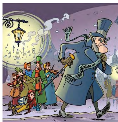
A Christmas Carol