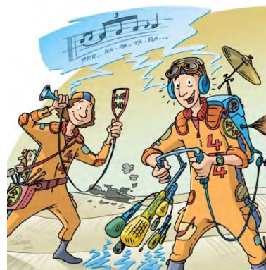
The Great Rhythmobile Adventure