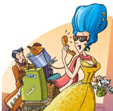
Annabelle Follows Her Voice

The popular Kinderconcert series, in its ninth season, offered four sets of quadruple performances presented in English and French on Sunday afternoons for three- to eight-year-olds in the NAC Panorama Room. Performances included: Annabelle Follows Her Voice (in November), Head in the Clouds (in January), The Great Rhythmobile Adventure (in April) and All Aboard to Planet Alloy (in June). Two special holiday Kinderconcert performances of A Christmas Carol were also offered in December. The series was sold-out with a total attendance of 4,629. Jeunesses Musicales of Canada once again partnered with the NAC to present the series. Interactive pre-concert activities were also presented to families prior to performances by NAC community partners, including Music for Young Children, and Ottawa Suzuki Strings.