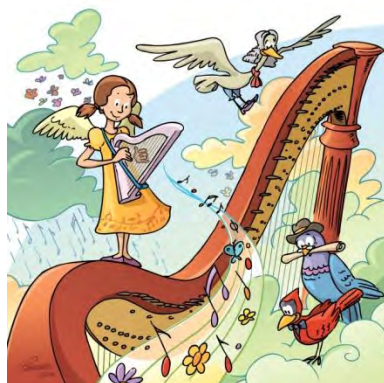
Head in the Clouds