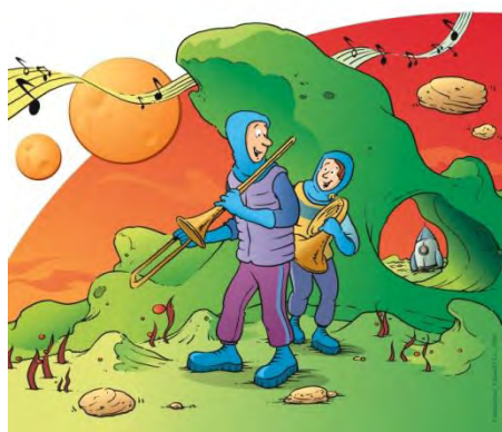
All Aboard to Planet Alloy